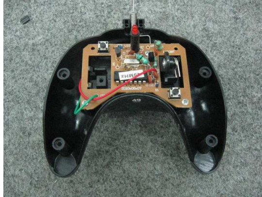
Rear View of the product (Internal)