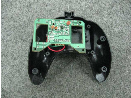
Front View of the product (Internal)