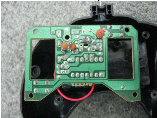
Inner Circuit Top View