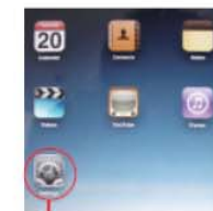
iPad [setting] icon

Step 3: Turn on and unlock iPad, Click on the iPad [settings] icon.