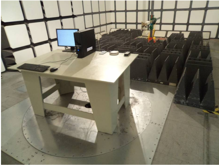
Radiated Emissions – Rear View (Above 1 GHz)