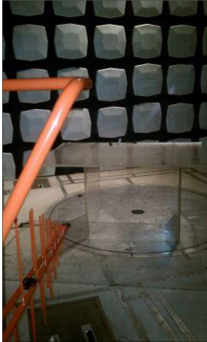
Photograph 1. Radiated Emissions, Test Setup