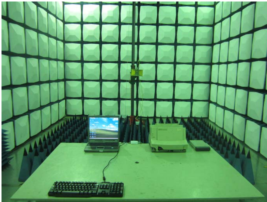
Radiated Emission above 1 GHz-Rear View