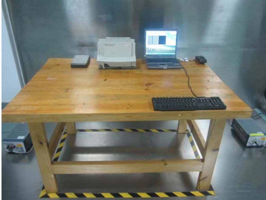
Conducted Emissions – Side View