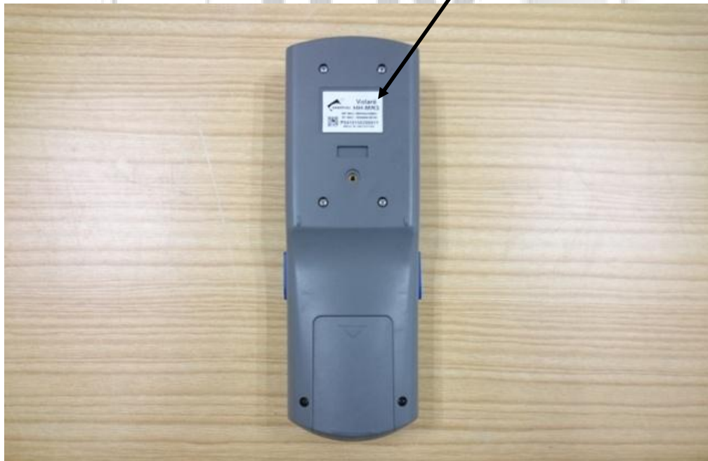
Physical Location of FCC Label on EUT