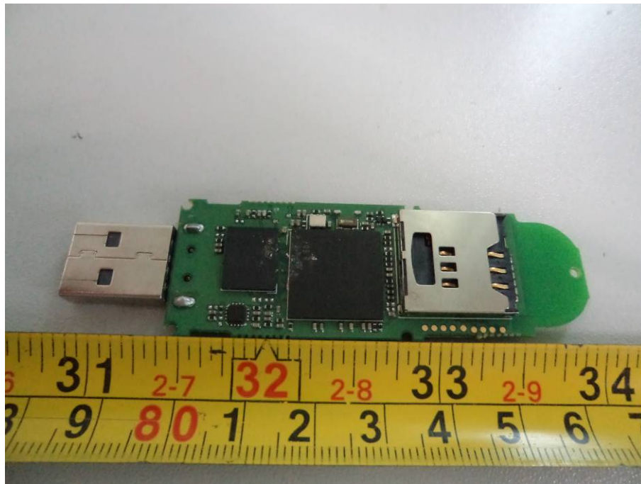
EUT – Antenna View