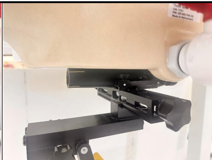
Curved surface of Left (EUT with 0 cm Gap)