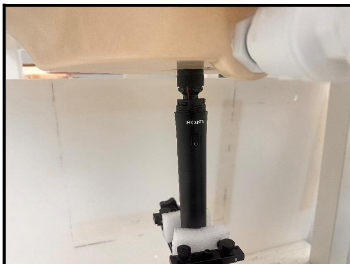
Top Side (EUT with 0 cm Gap)