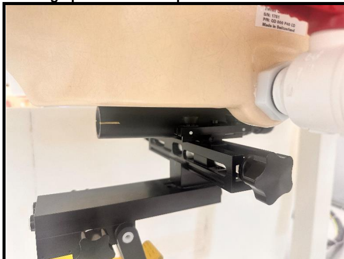
Front Side (EUT with 0 cm Gap)