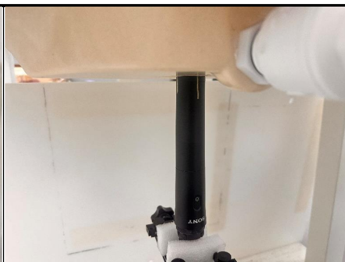
Bottom Side (EUT with 0 cm Gap)