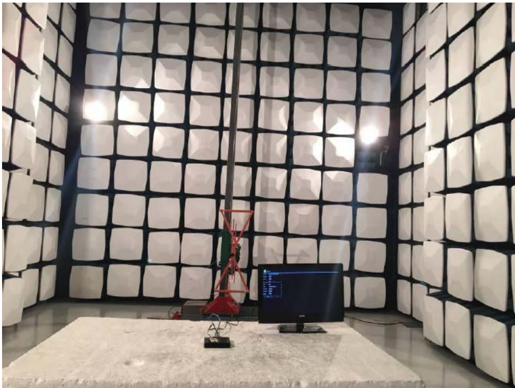
Radiated Test (1000-25000 MHz)