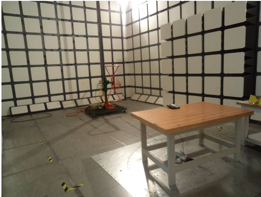
Radiated Emissions - Rear View (Below 1 GHz)