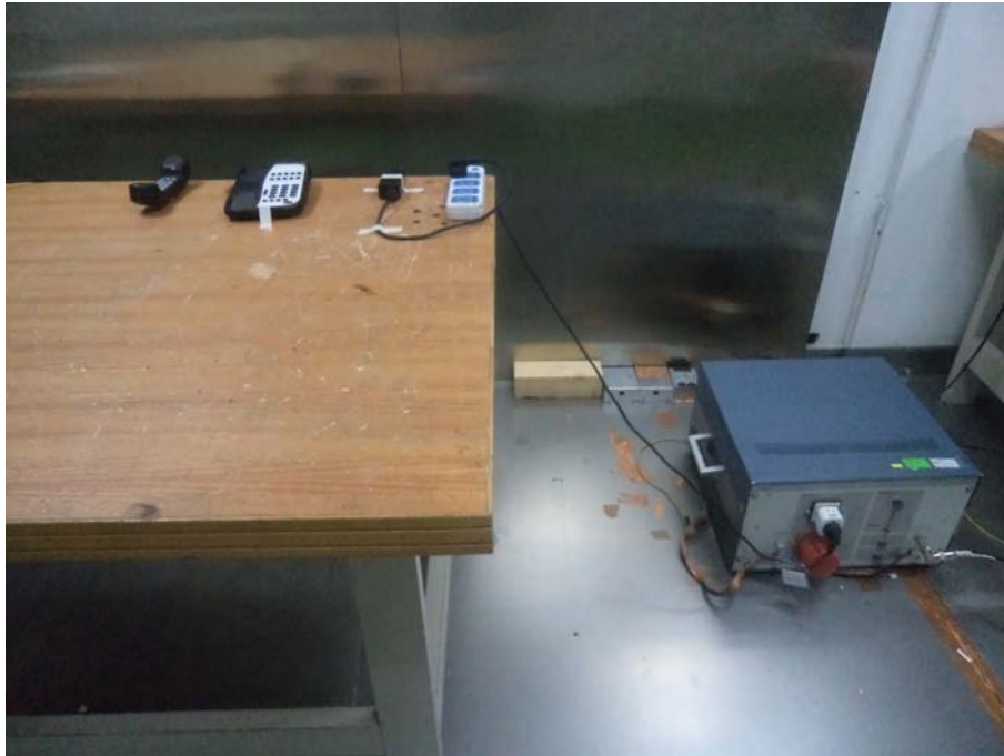
Conducted Emissions - Side View