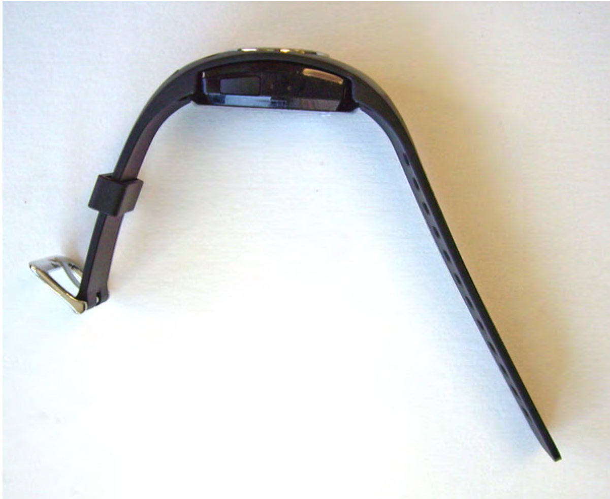
Figure 12-1 Edge View of MPERS LC120