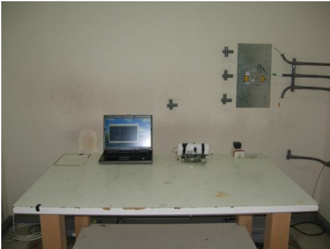
Back View of Conducted Test - CX870-D