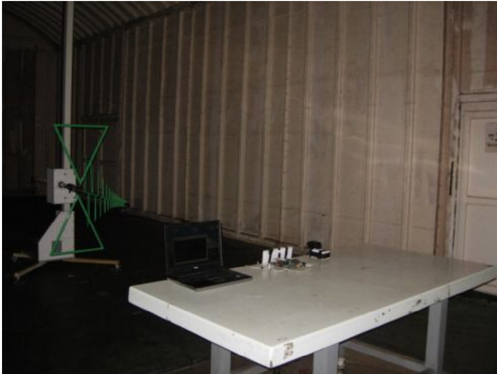
Back View of Radiated Test - CX870-D60