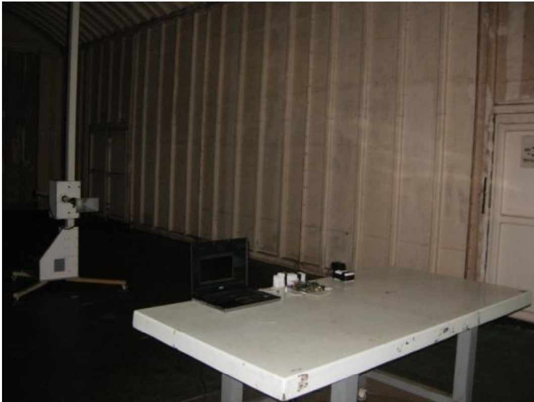
Back View of Radiated Test (Horn) - CX870-D