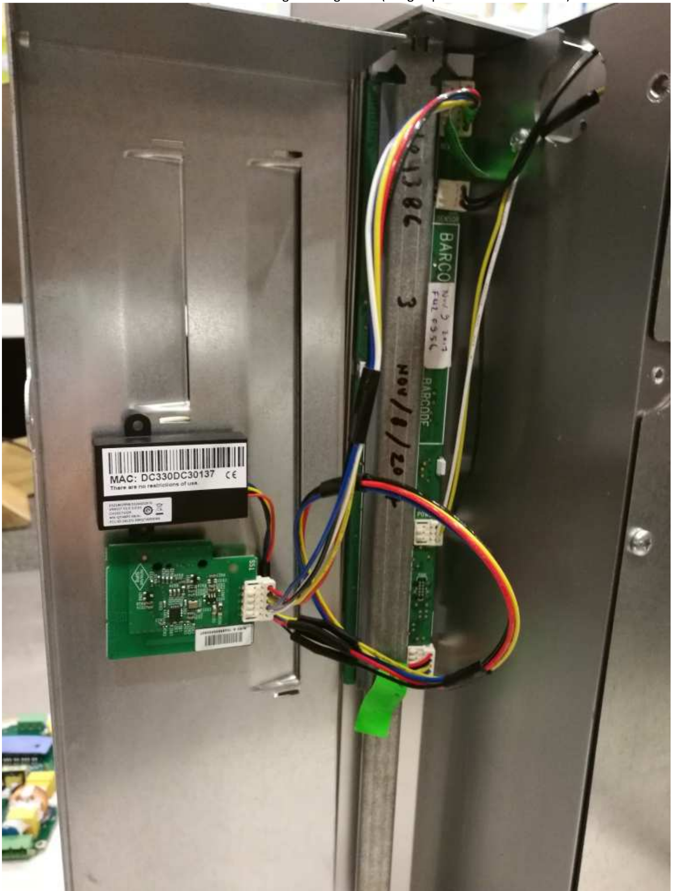
Close up on internal