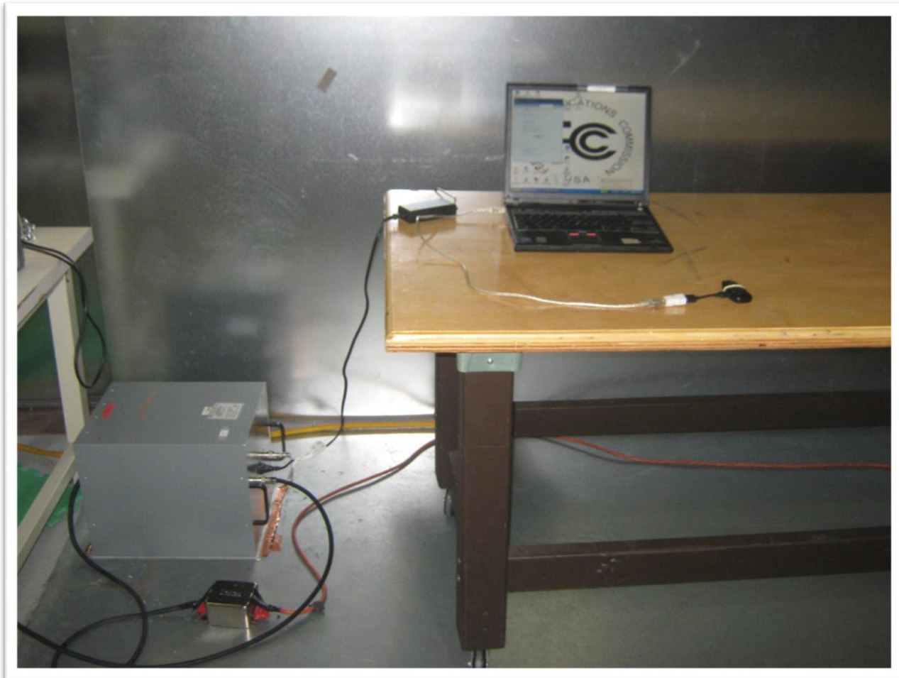
Figure 3 – Conducted emissions