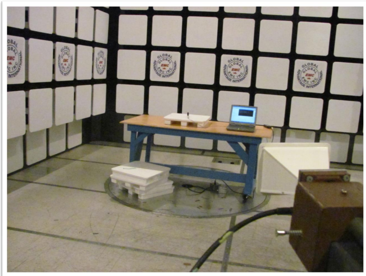
Figure 1 – Radiated emissions