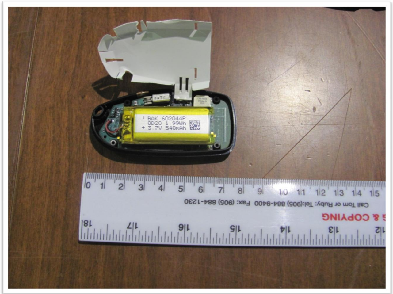
Figure 2 – EUT with chassis open Top