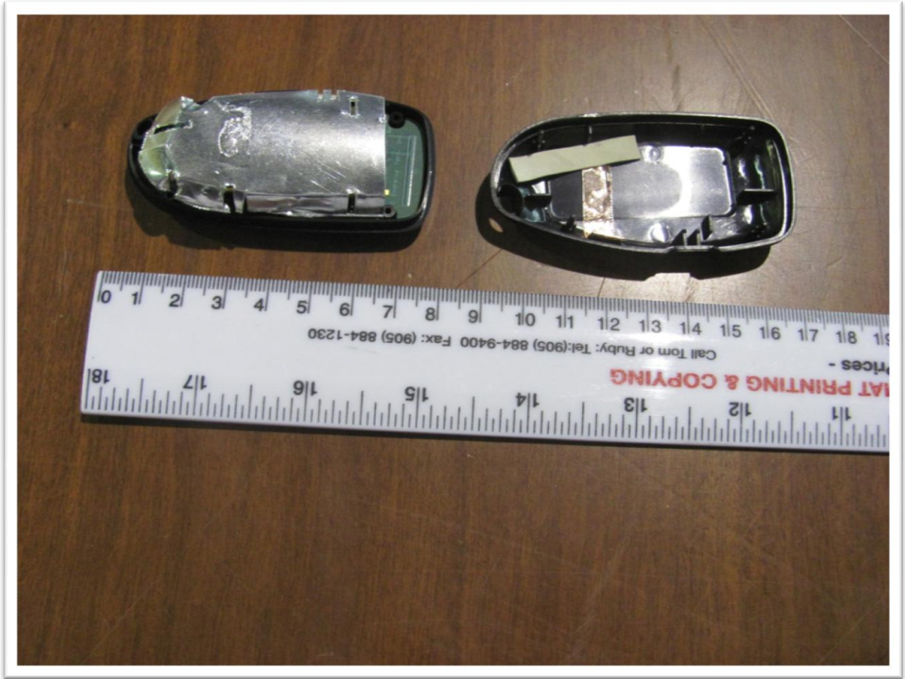
Figure 1 – EUT with chassis open Top