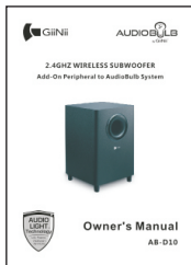
3. Owner's Manual