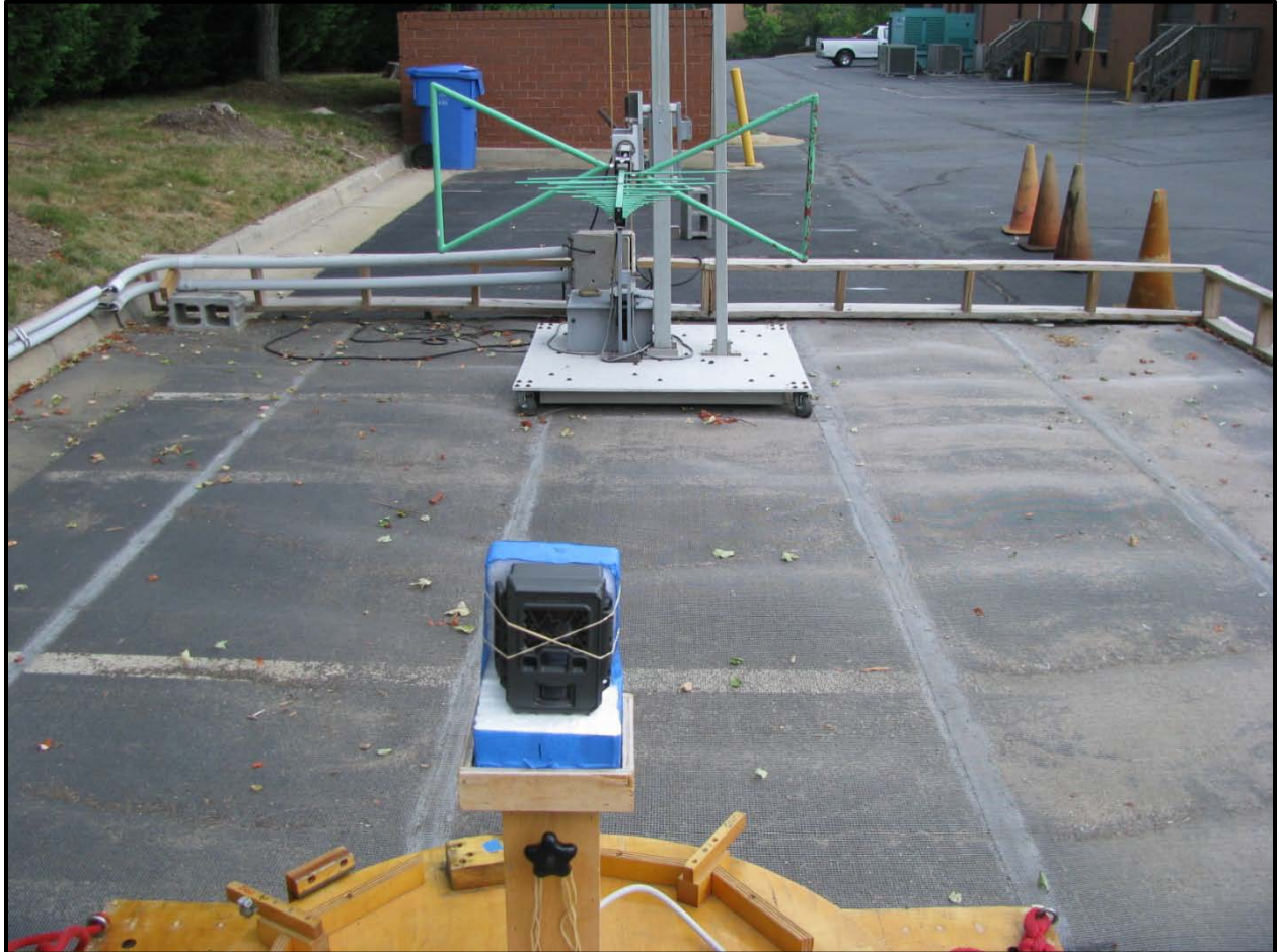
Photograph 3: Radiated Emissions