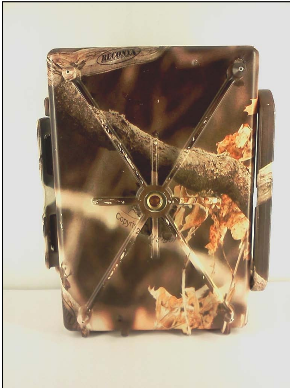
Photograph 6: Rear