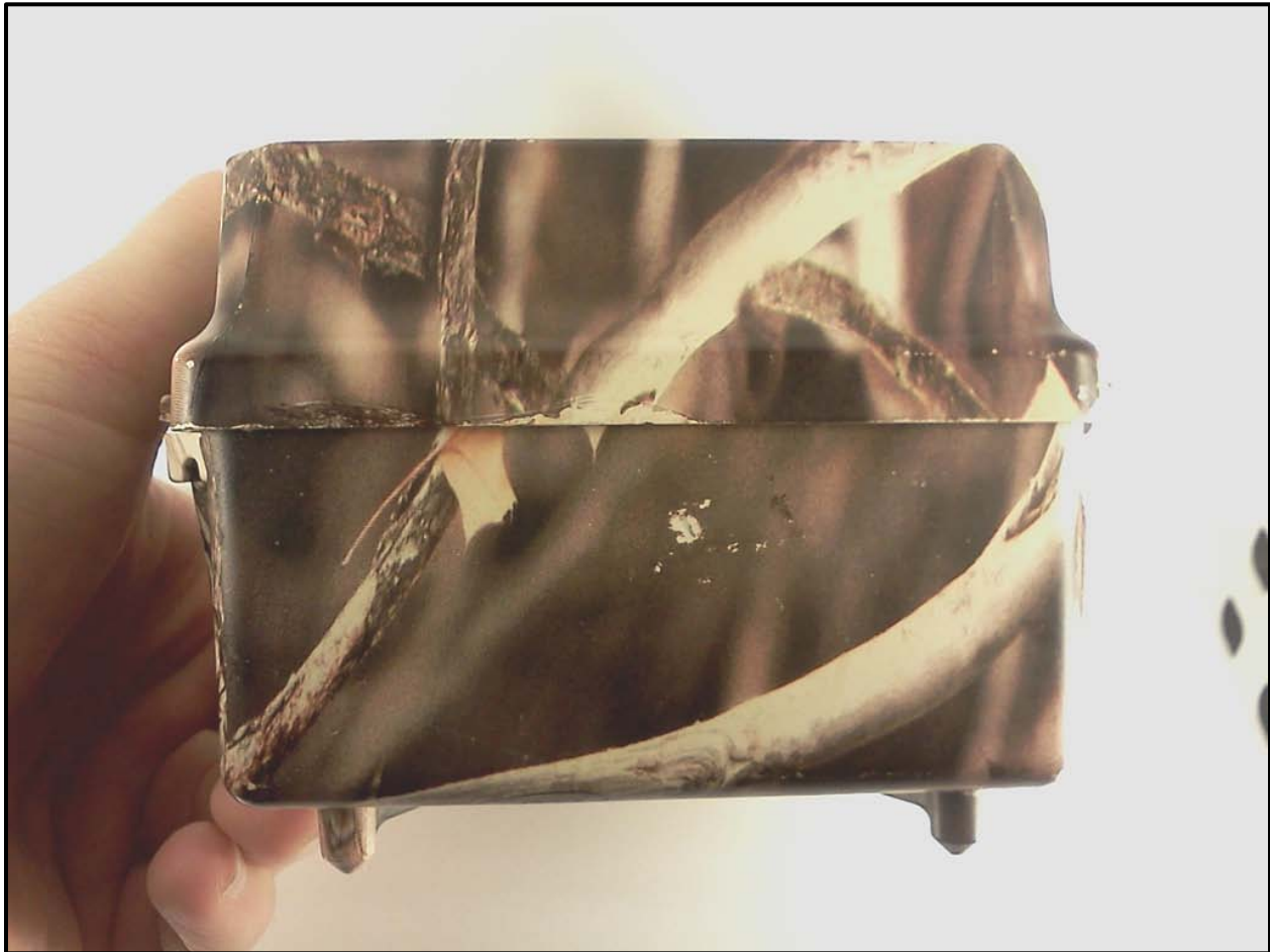
Photograph 9: Top

Client: Reconyx, Inc. Model: RTI350 Standard: FCC 15.231 FCC ID: ZON-HF-RTI Report #: 2011110