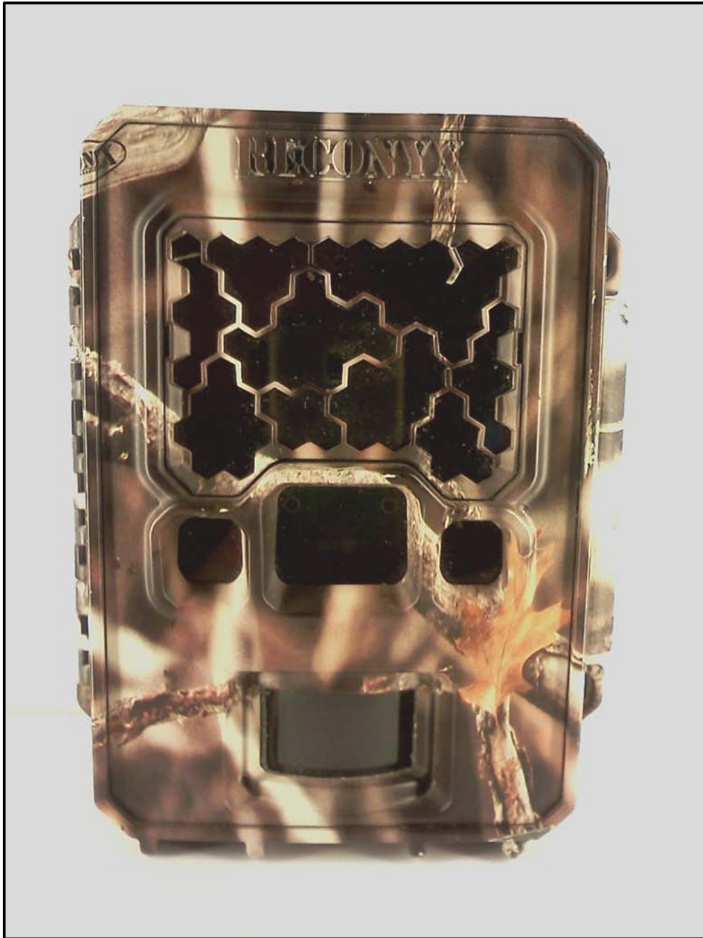
Photograph 5: Front Face

Client: Reconyx, Inc. Model: RTI350 Standard: FCC 15.231 FCC ID: ZON-HF-RTI Report #: 2011110