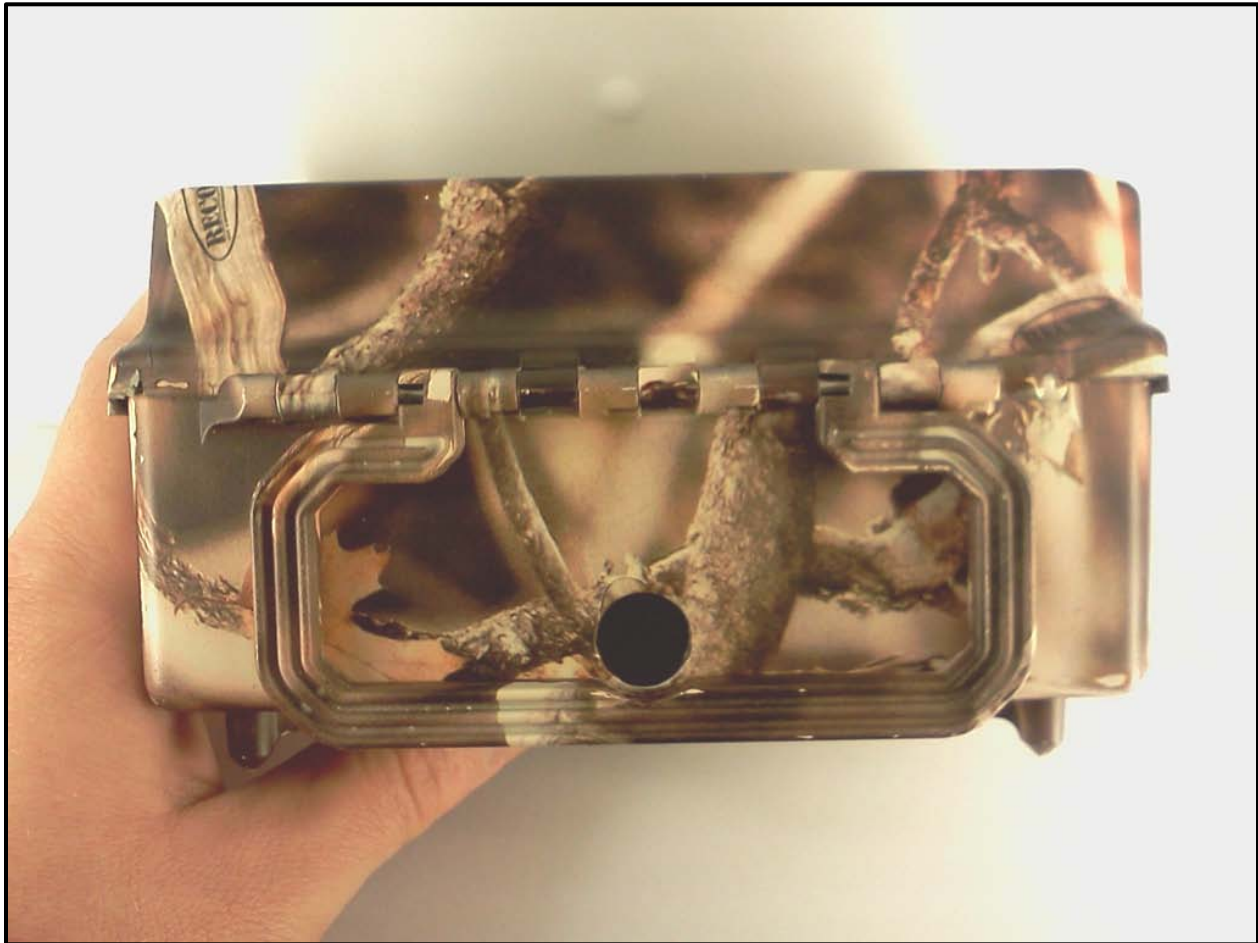
Photograph 7: Side with Hinge