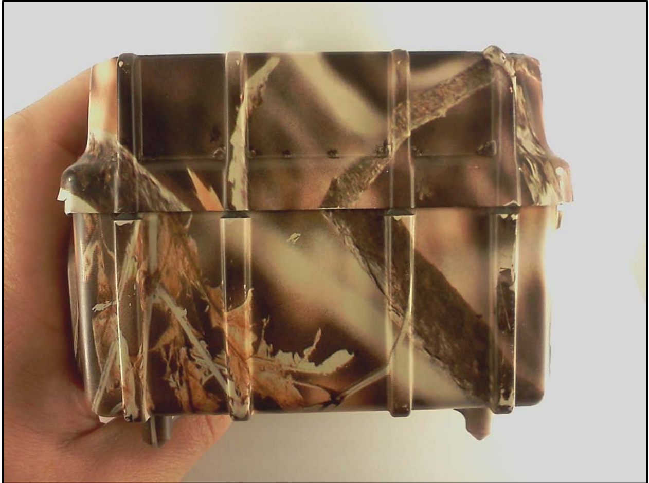
Photograph 4: Bottom