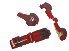
Wire Insulation Displacement Terminals (7 per pack)