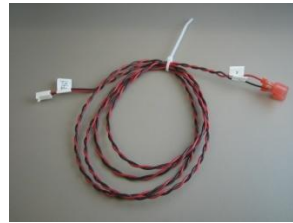
#7964 Game Power Wire Harness