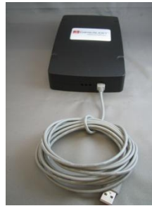
Wireless network Coordinator and USB Cable