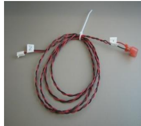
#7964 Power Wire Harness