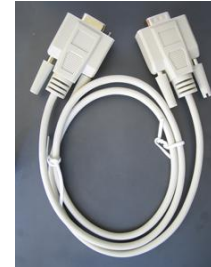
3 ft. DB9 Cable