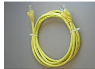
6' Ethernet Cable