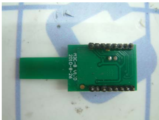
PCB layout view-4

Copyright of this report is owned by Centre of Testing Service and may not be reproduced other than in full except with the written approval of the issuing Company.