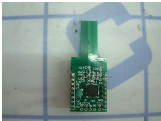
PCB layout view-3