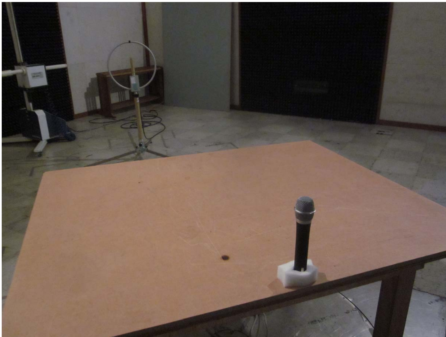
Radiated Emission_Below 30 MHz_Rear