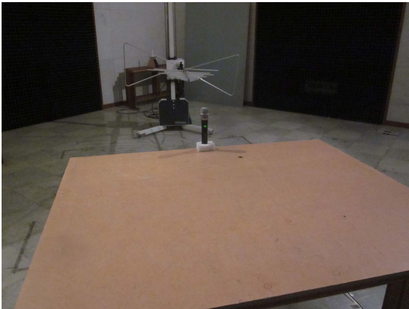
Radiated Emission_Below 1 GHz_Front