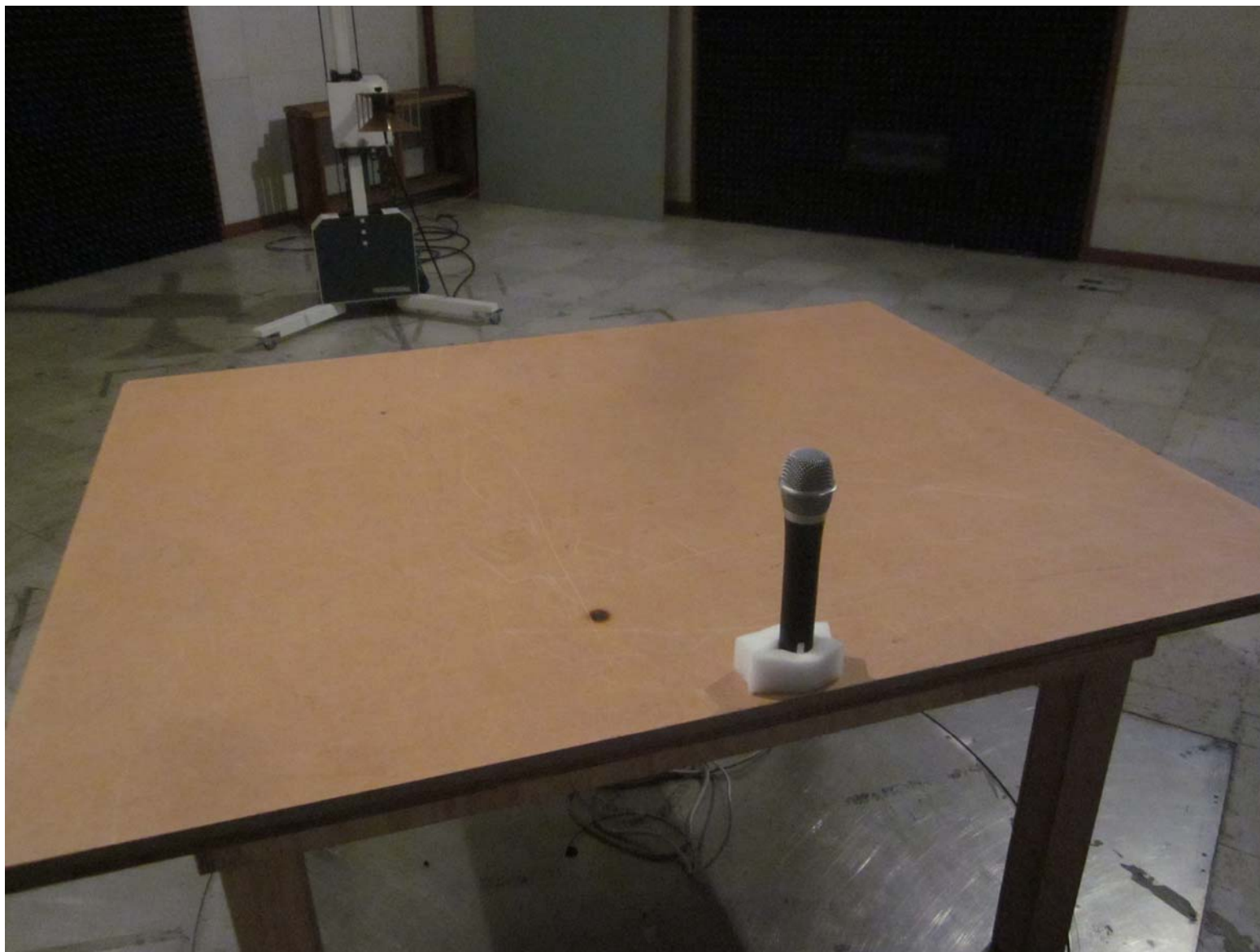
Radiated Emission_Above 1 GHz_Rear