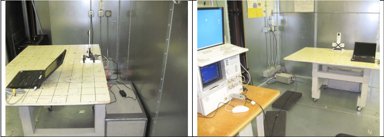
Conducted emissions onto AC mains measurement.