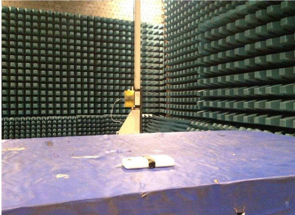
Higher than 1GHz, Y axis