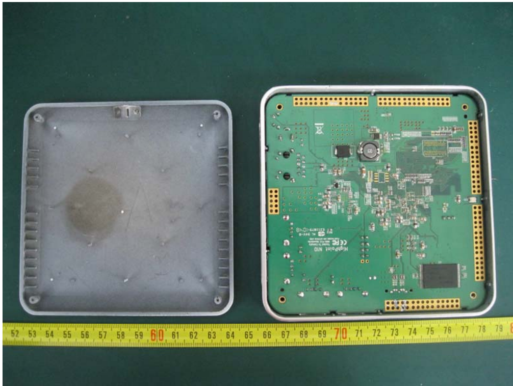
EUT – Component View 2 Shield ON