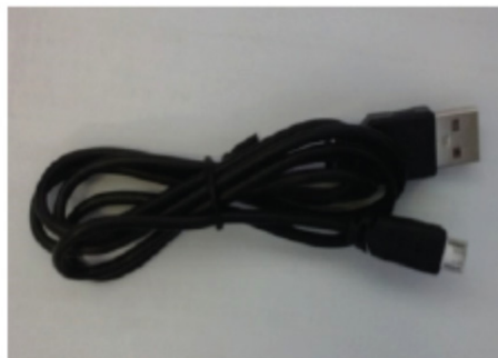
USB Cable (5 Ft)