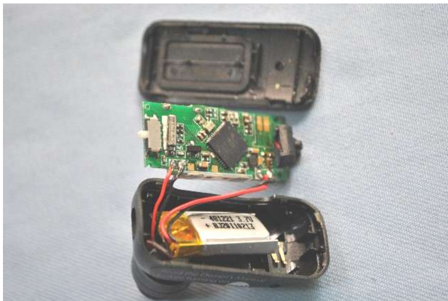
Main & RF board component side