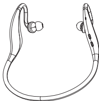
WhiteLabel Music Jogger 2