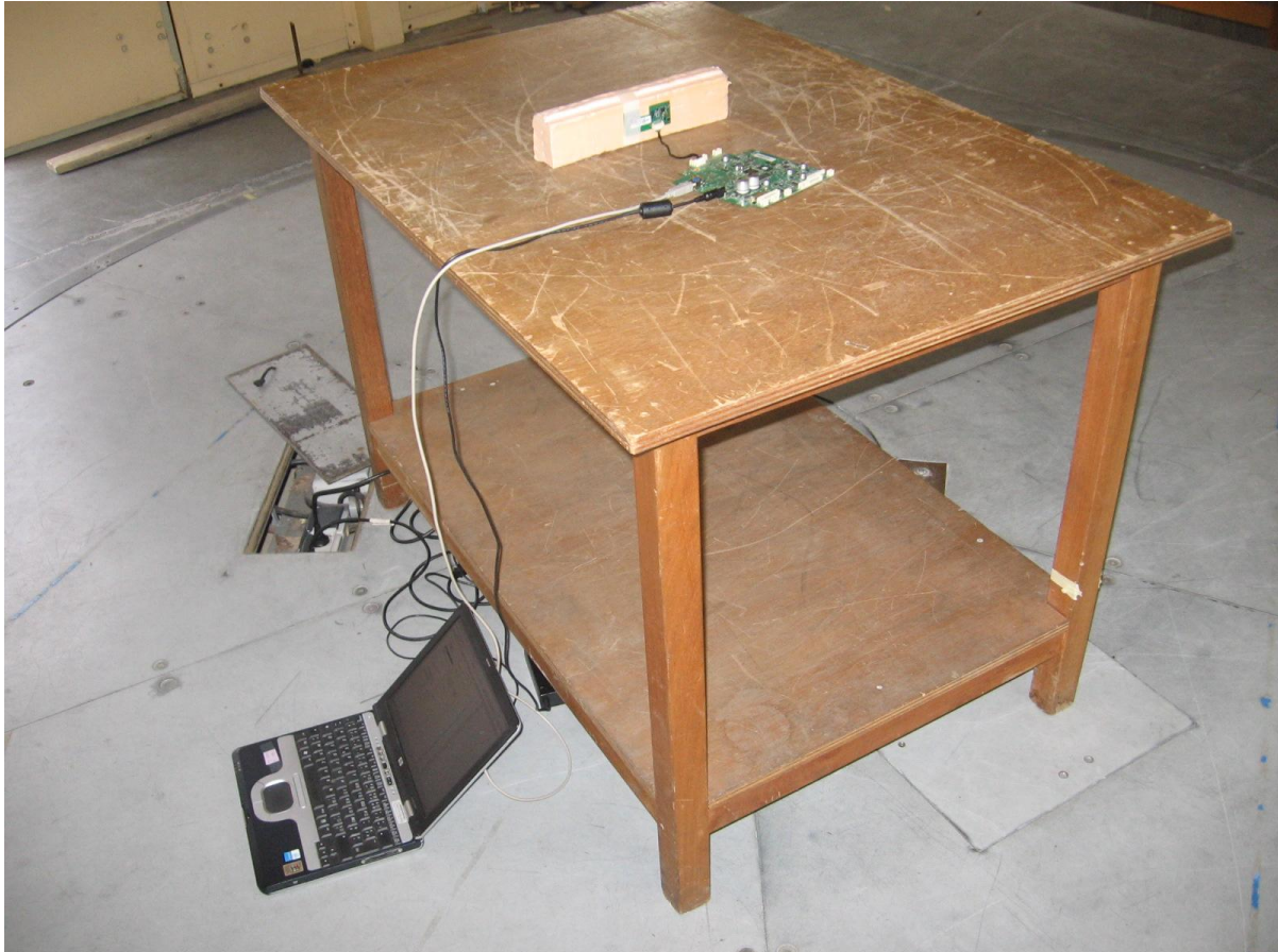
Antenna in front of the equipment with turntable at 0°