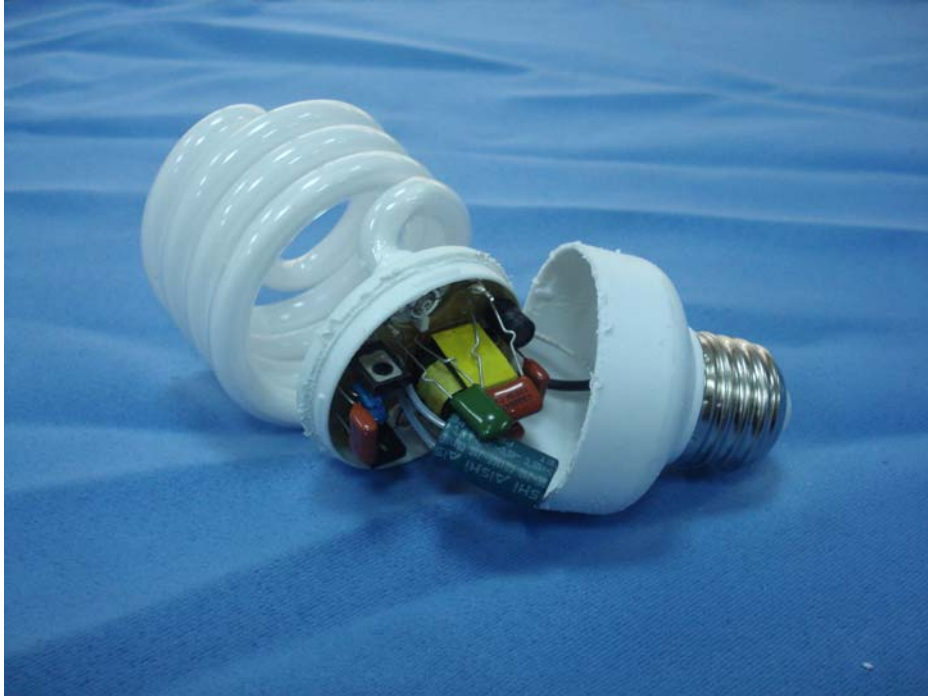
EUT - PCB Front View