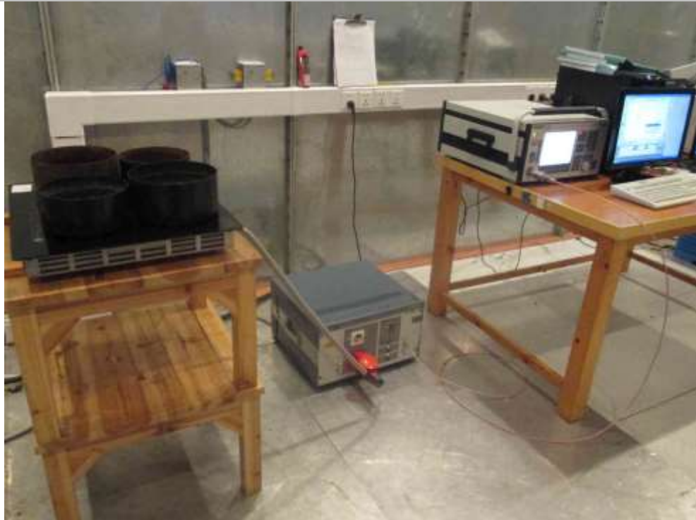
Radiated Emission 9k-30MHz