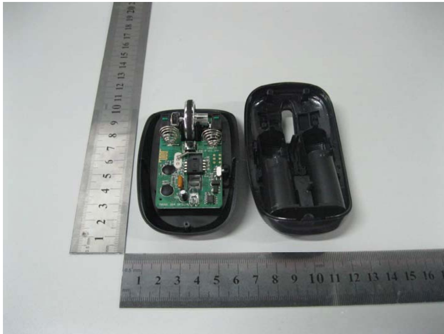
Figure 5 PCB of the EUT- PCB Face View