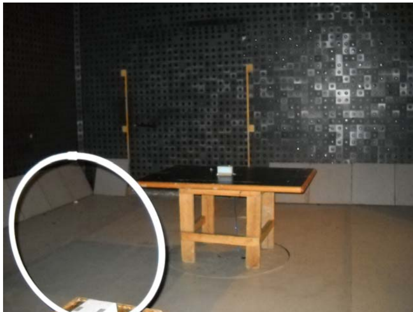
Photograph No.1 Setup for spurious emission measurements in the anechoic chamber below 30 MHz