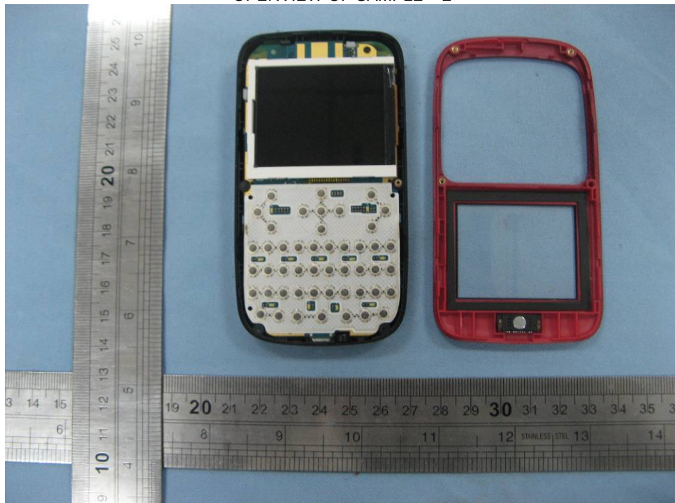
INTERNAL VIEW OF SAMPLE – 1