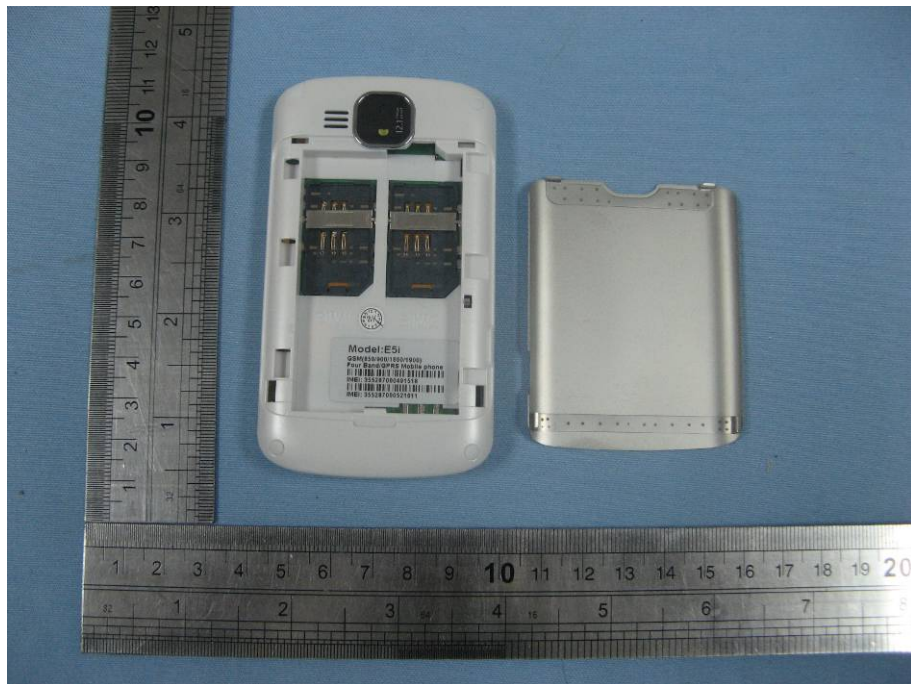
OPEN VIEW OF SAMPLE-2