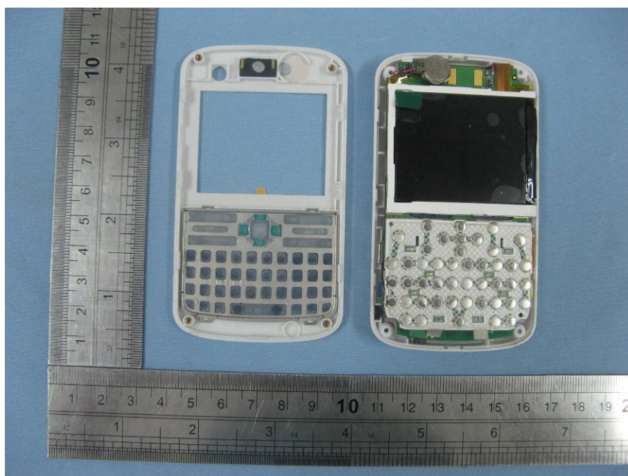
INTERNAL VIEW OF SAMPLE – 1