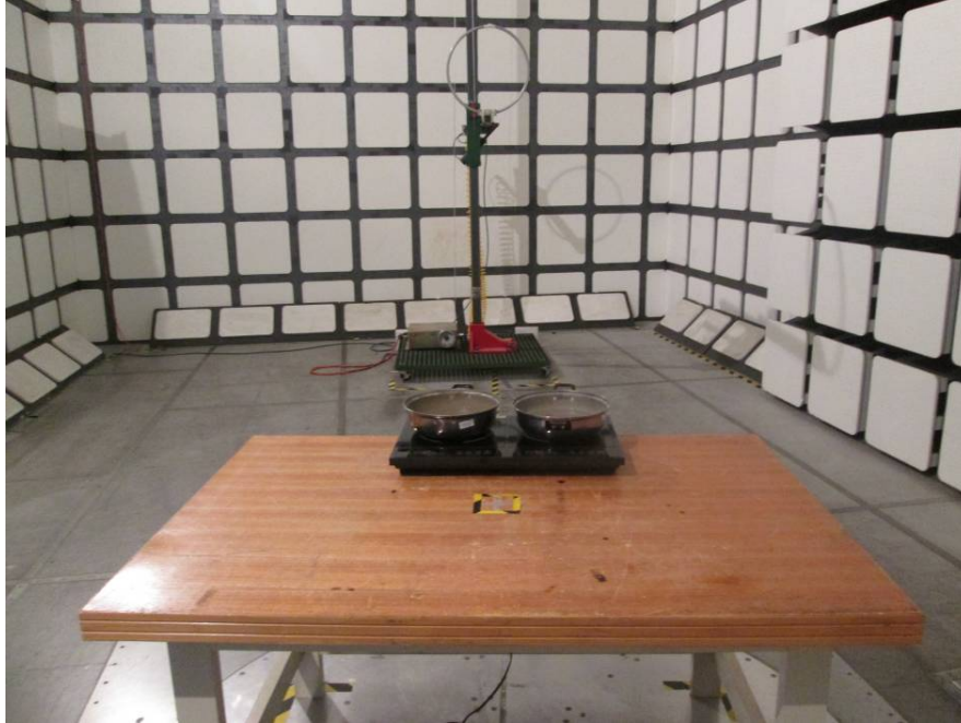
Radiated Emissions - Rear View (90 kHz-30 MHz)