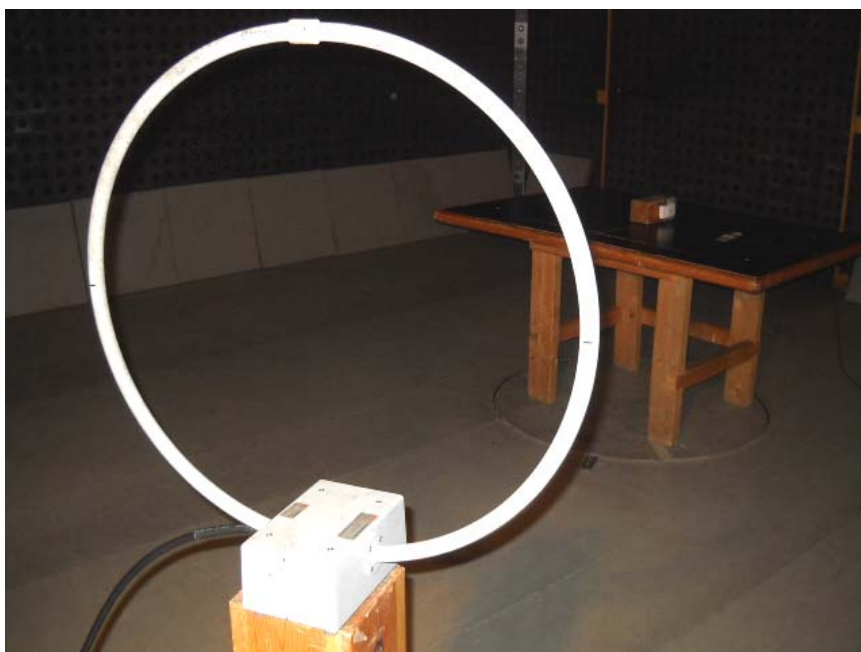
Photograph No.1 Setup for in band radiated emission measurements and out of band spurious radiated emission measurements below 30 MHz in the anechoic chamber