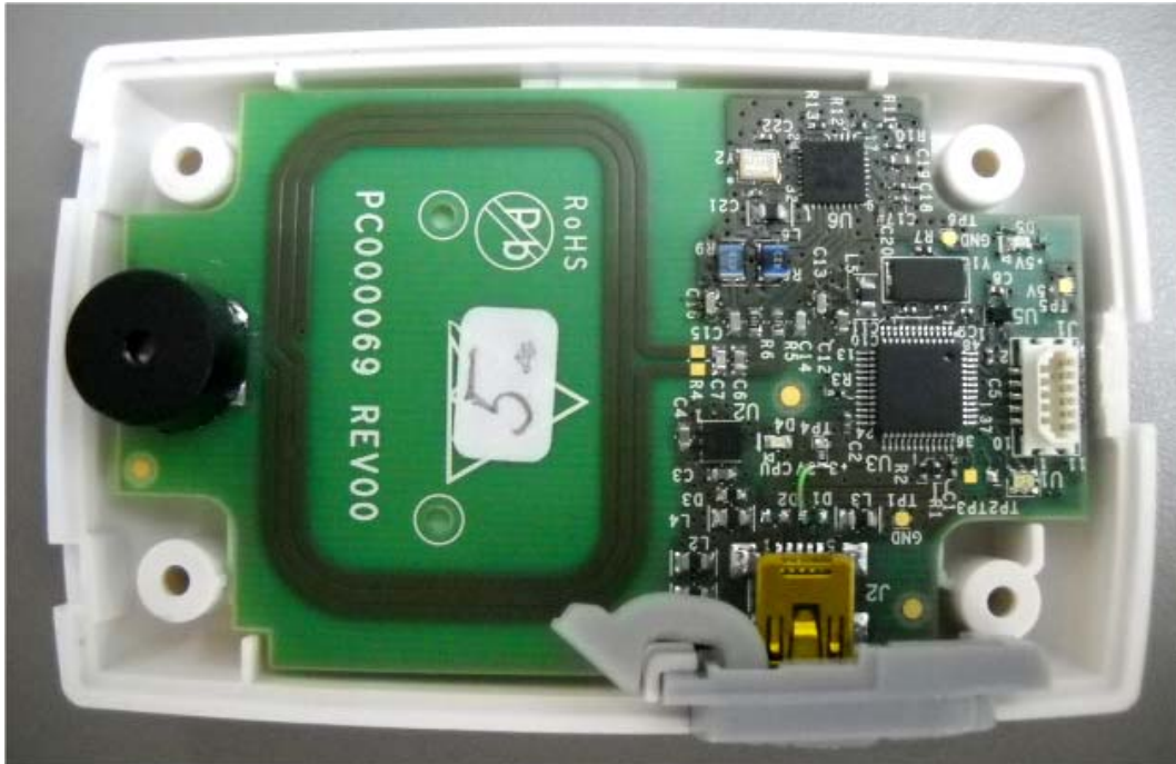
Photograph No.1 Internal view