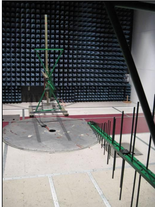
Photograph 1. EIRP, Test Setup, 850 MHz