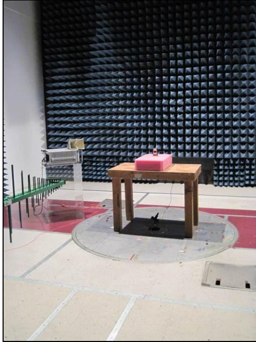
Photograph 3. Radiated Emissions, Test Setup, Below 1 GHz