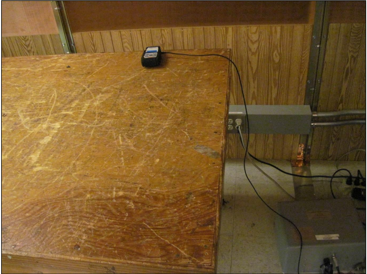
Photograph 5. Conducted Emissions, Test Setup