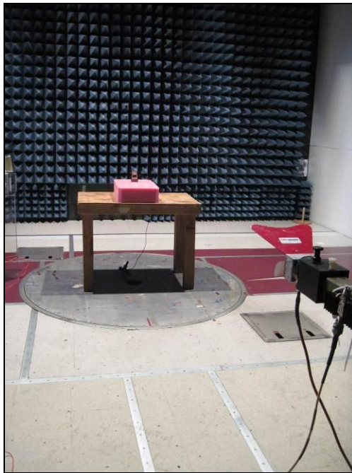
Photograph 4. Radiated Emissions, Test Setup, Above 1 GHz