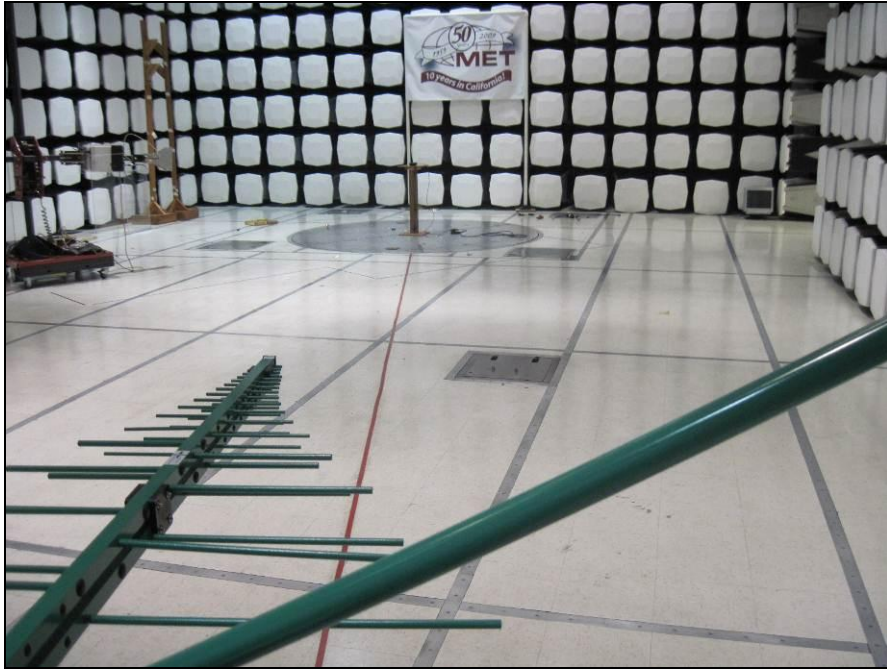
Photograph 6. Radiated Emission, Test Setup, 30 MHz – 1 GHz