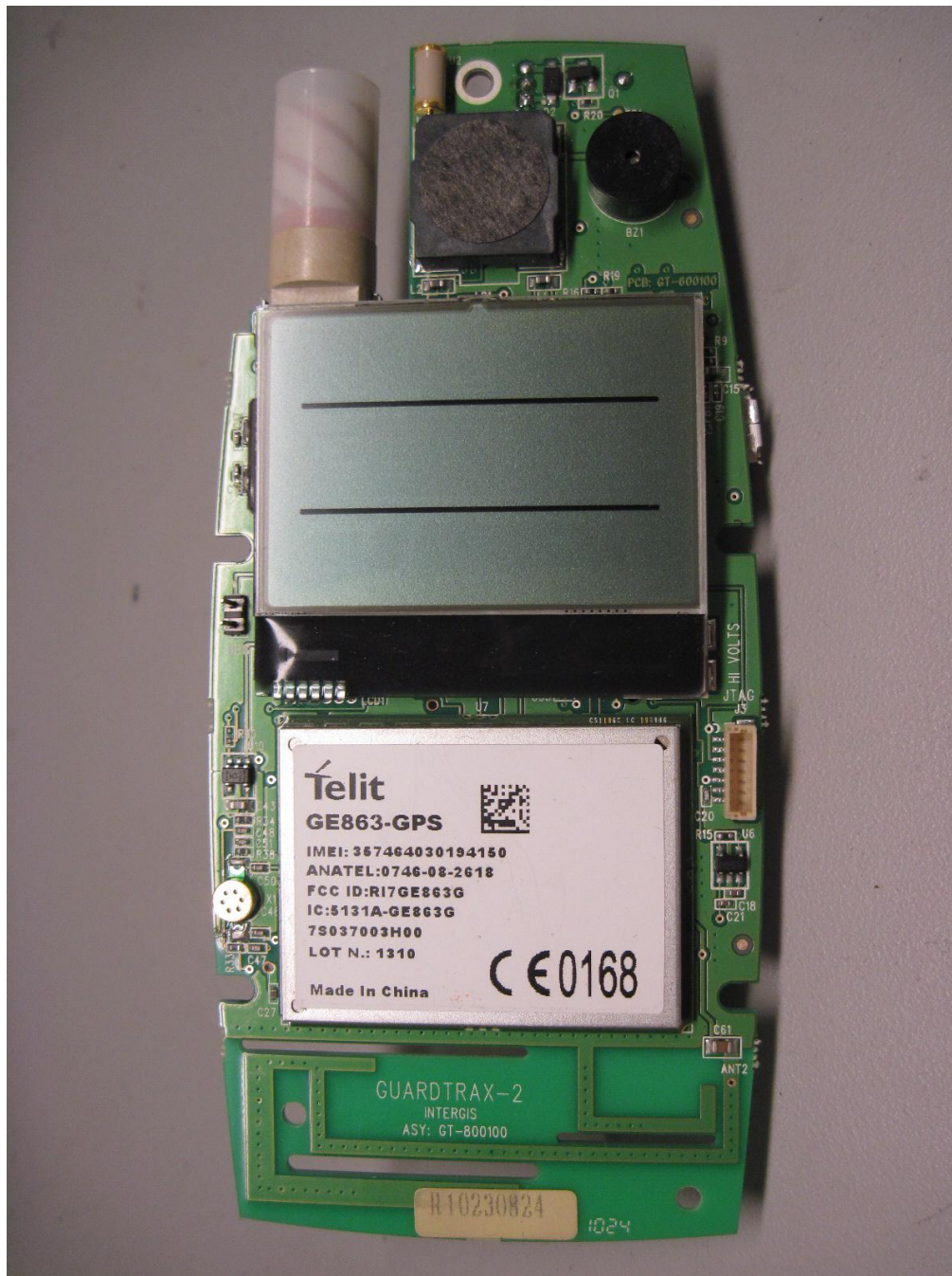
Photograph 1. EUT Board Front View