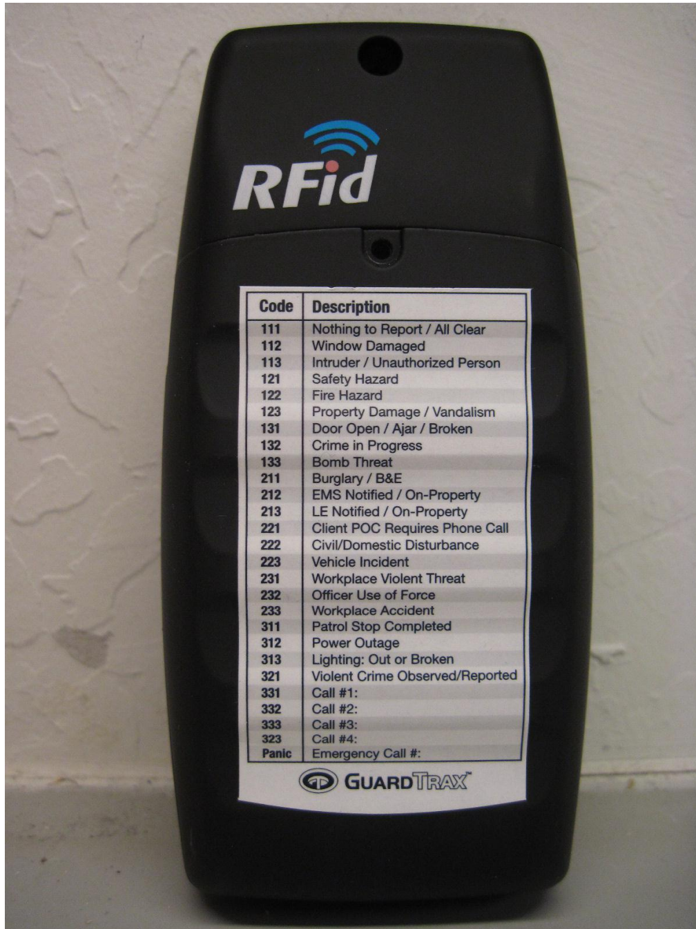
Photograph 6. EUT Rear View