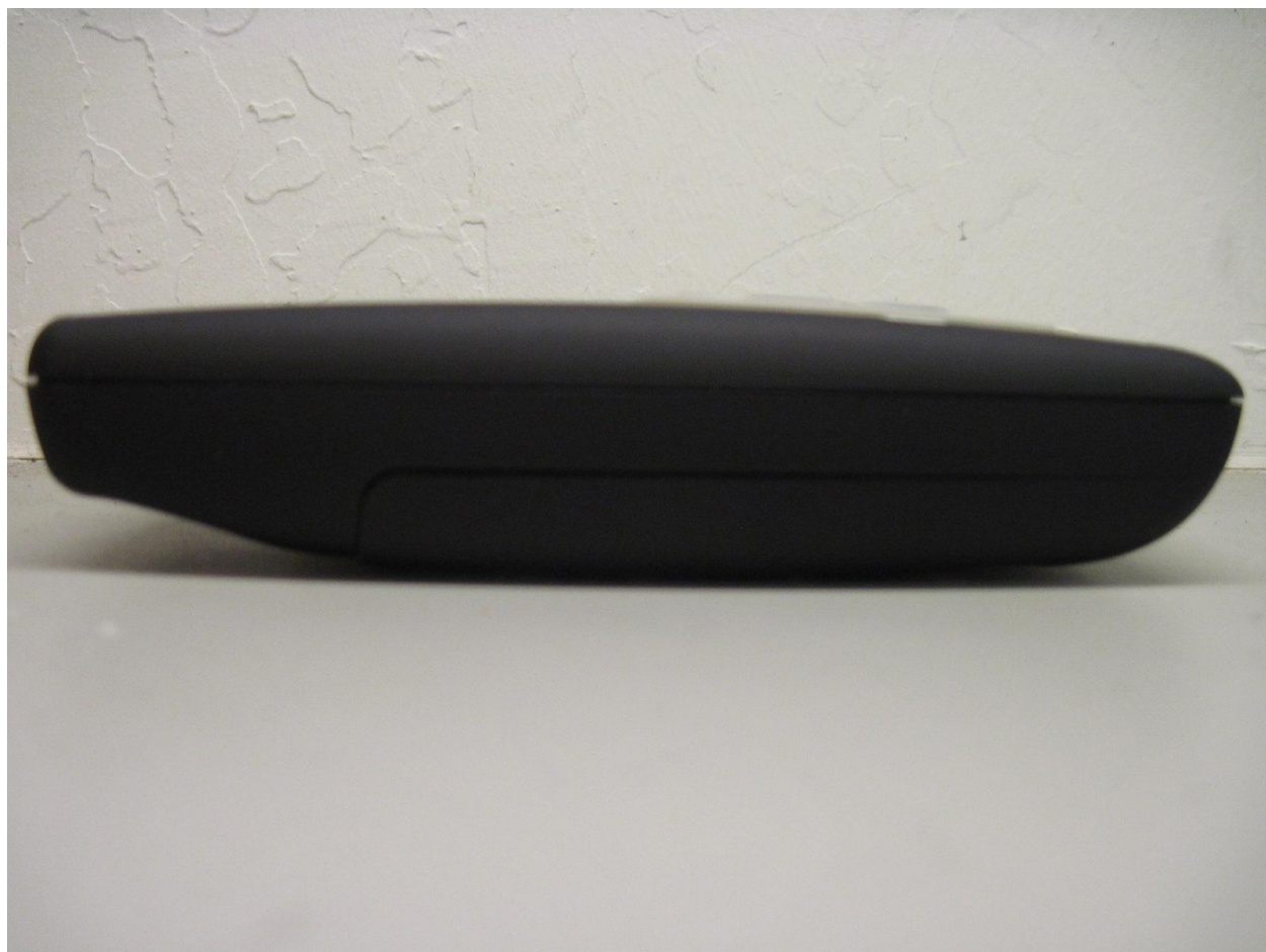
Photograph 5. EUT Left Side