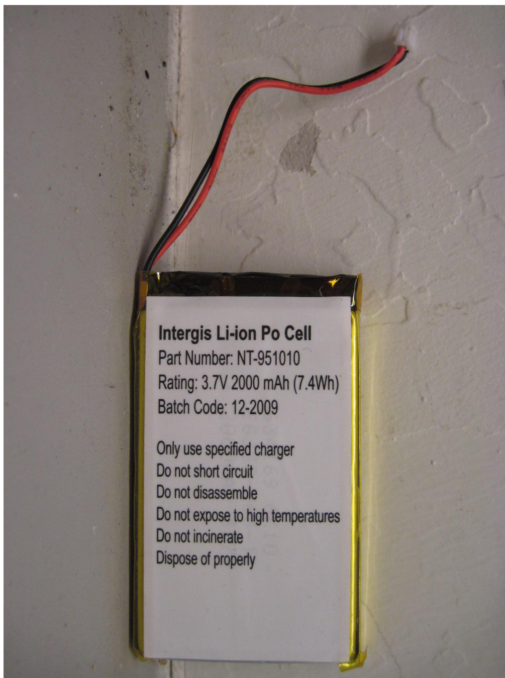
Photograph 2. Battery Front