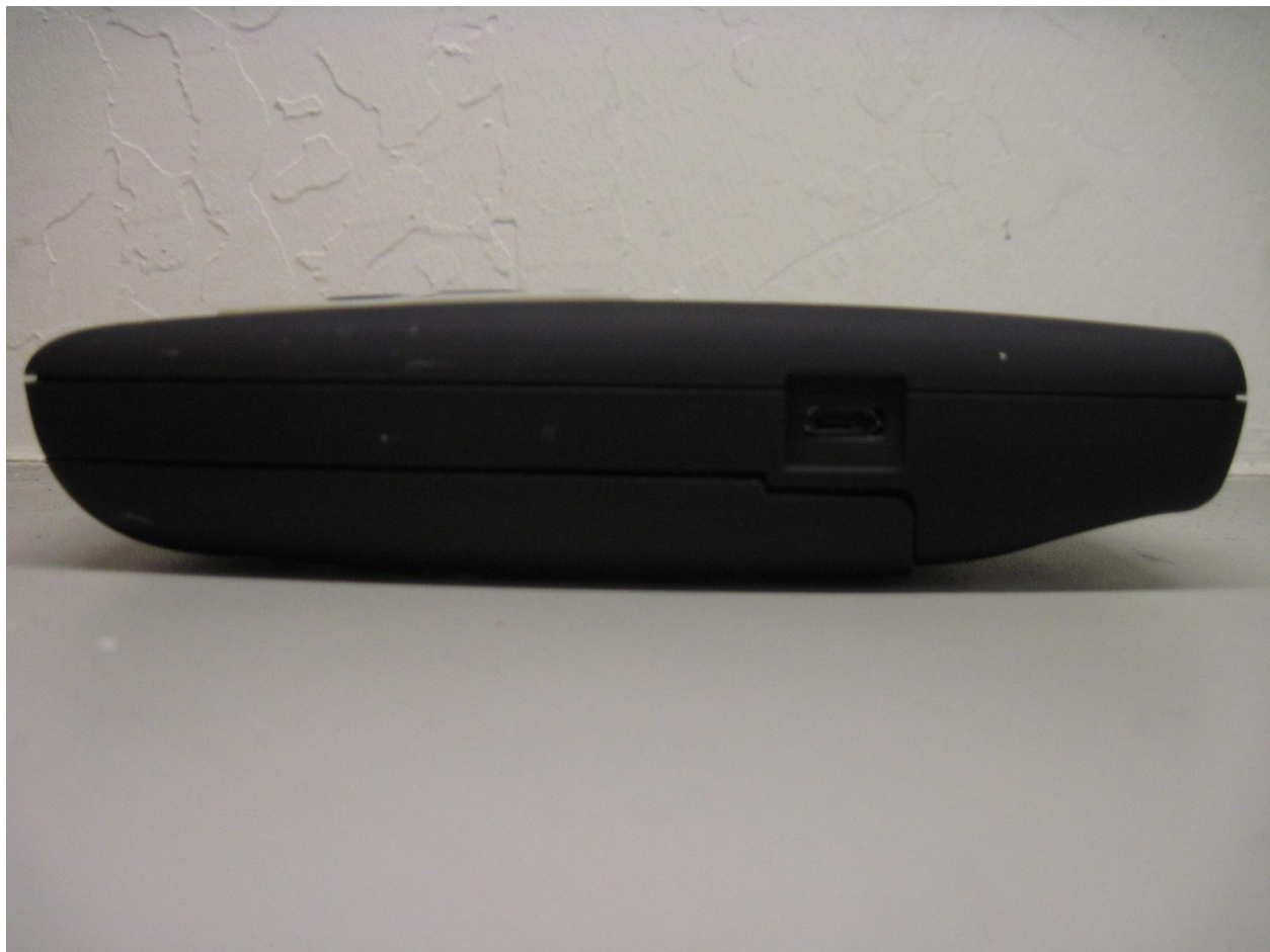
Photograph 7. EUT Right Side