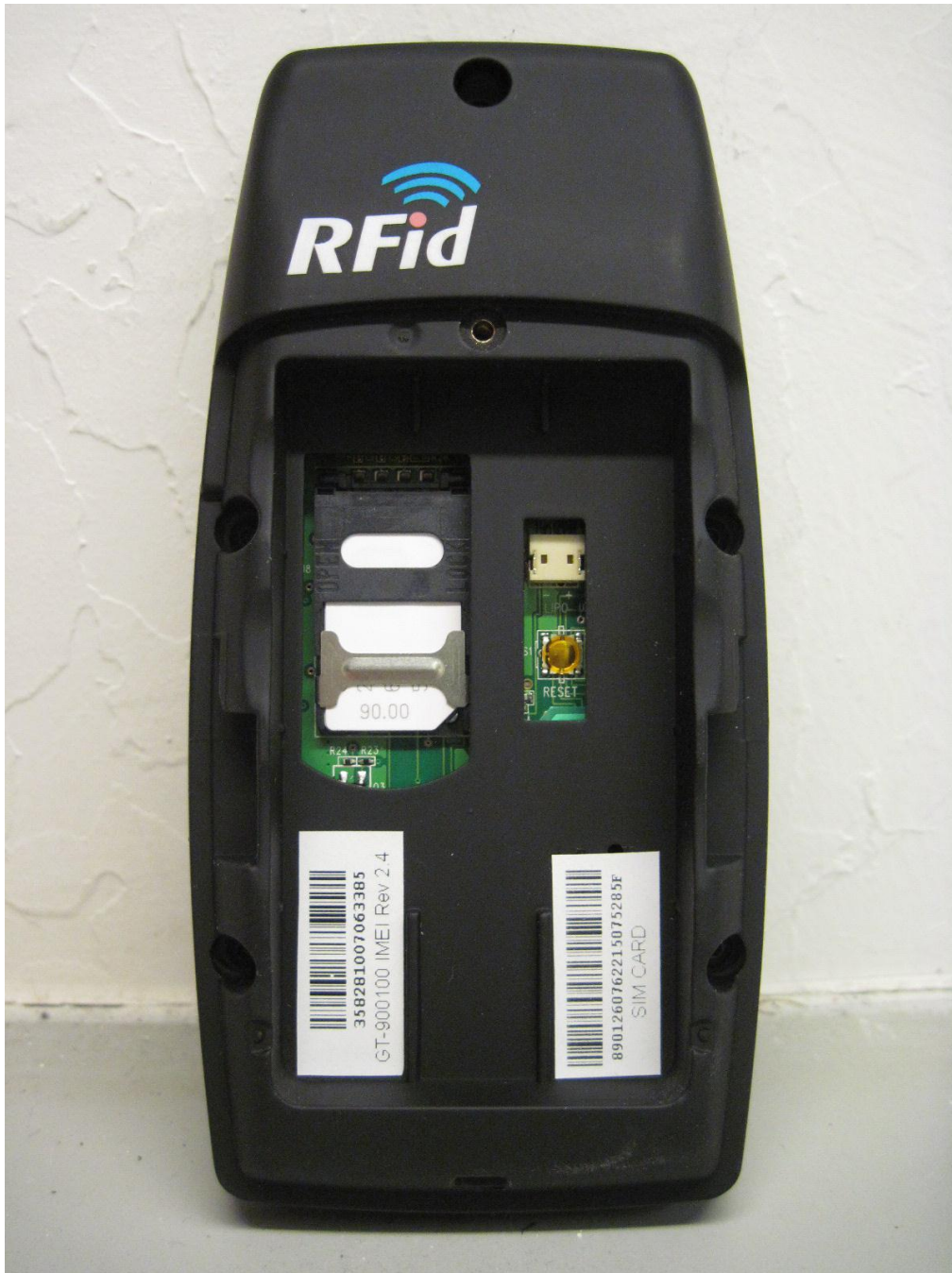
Photograph 8. EUT with Battery Removed