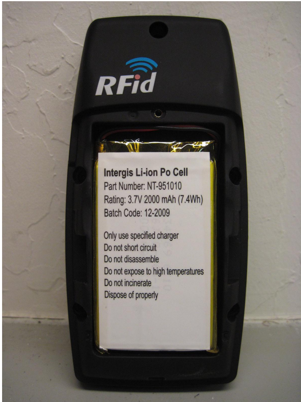
Photograph 9. EUT without Batter Cover