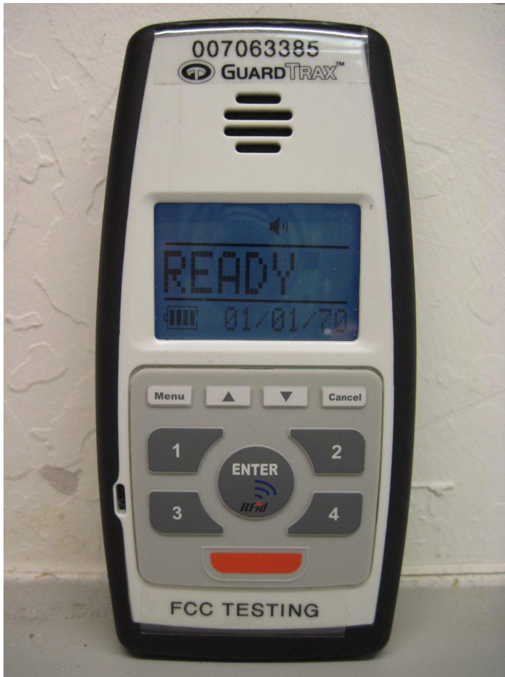
Photograph 4. EUT Front View