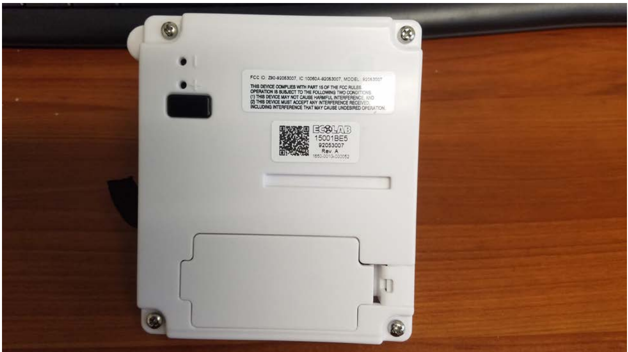
Figure 4: Sample Label Location (2)