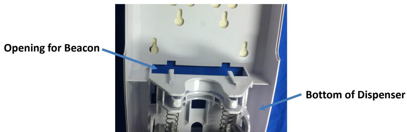
Figure 4. Interior view showing beacon installation opening and Nexa Manual Dispenser (Interior View)