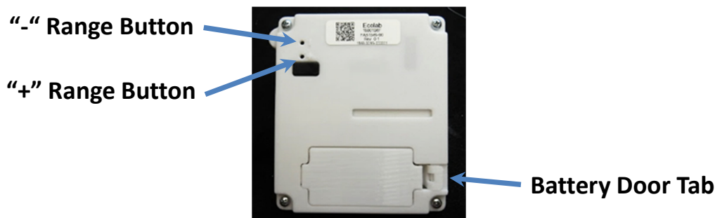
Figure 2. Back view, showing, battery door tab, and range button locations