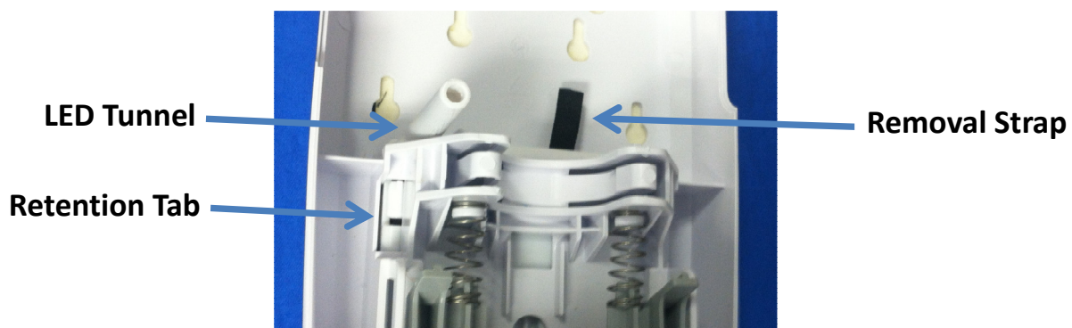
Figure 5. Beacon Installed in Dispenser