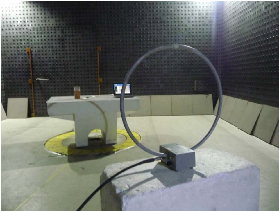
Photograph No.1 Setup for fundamental and spurious emission field strength measurements in the anechoic chamber below 30 MHz