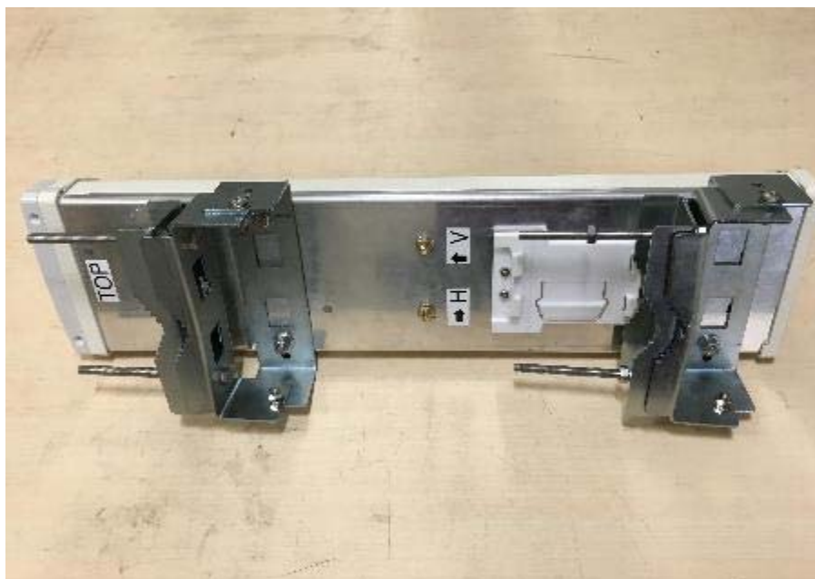
Figure 4: Photograph of 17 dBi Transmitter Antenna-Back view