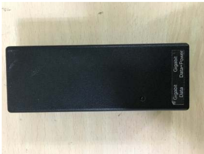
Figure 6: Photograph of AC Adapter Top view