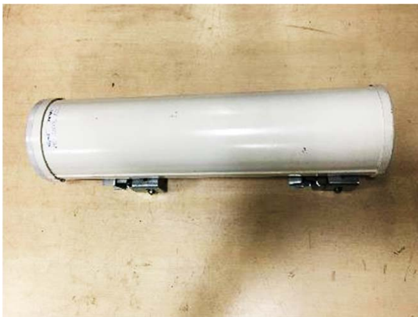
Figure 3: Photograph of 17 dBi Transmitter Antenna-Top view