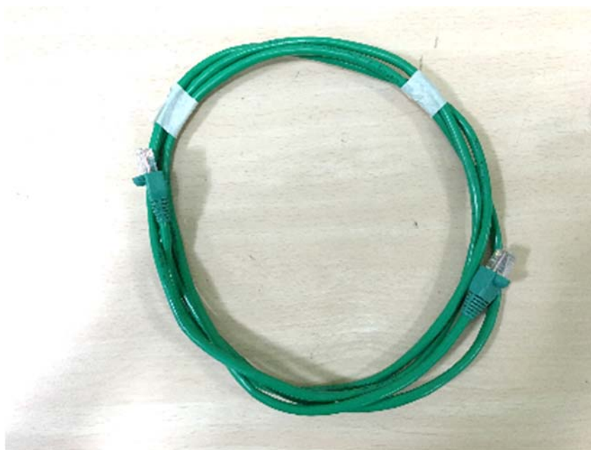
Figure 9: Photograph of RJ45 POE cable