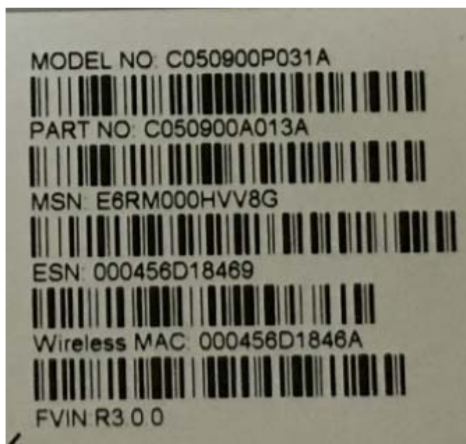
Figure 2: Photograph of model number & part number on the EUT