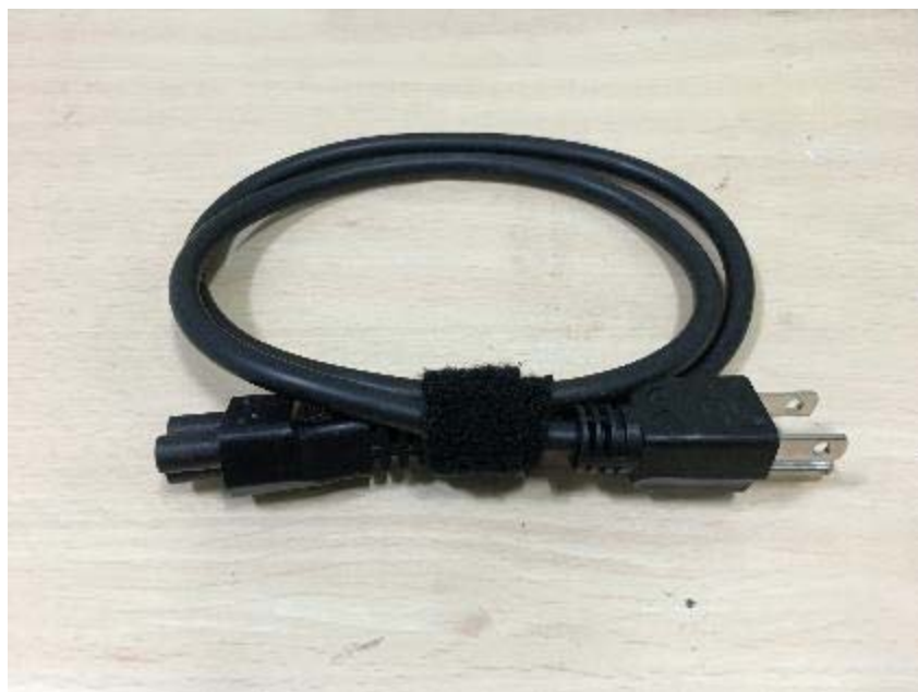
Figure 8: Photograph of AC Power chord