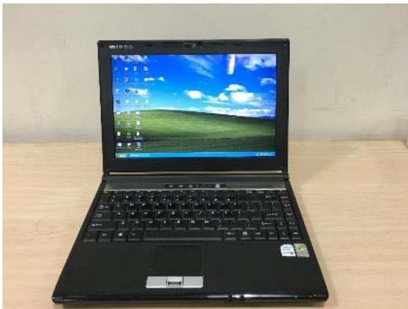
Figure 11: Photograph of Laptop used to configure EUT