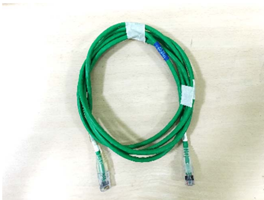
Figure 10: Photograph of RJ45 Data cable