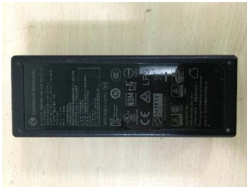
Figure 7: Photograph of AC Adapter back view