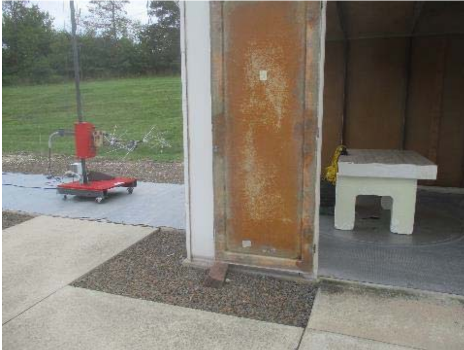
Horizontal Antenna Polarization, 30 to 200 MHz