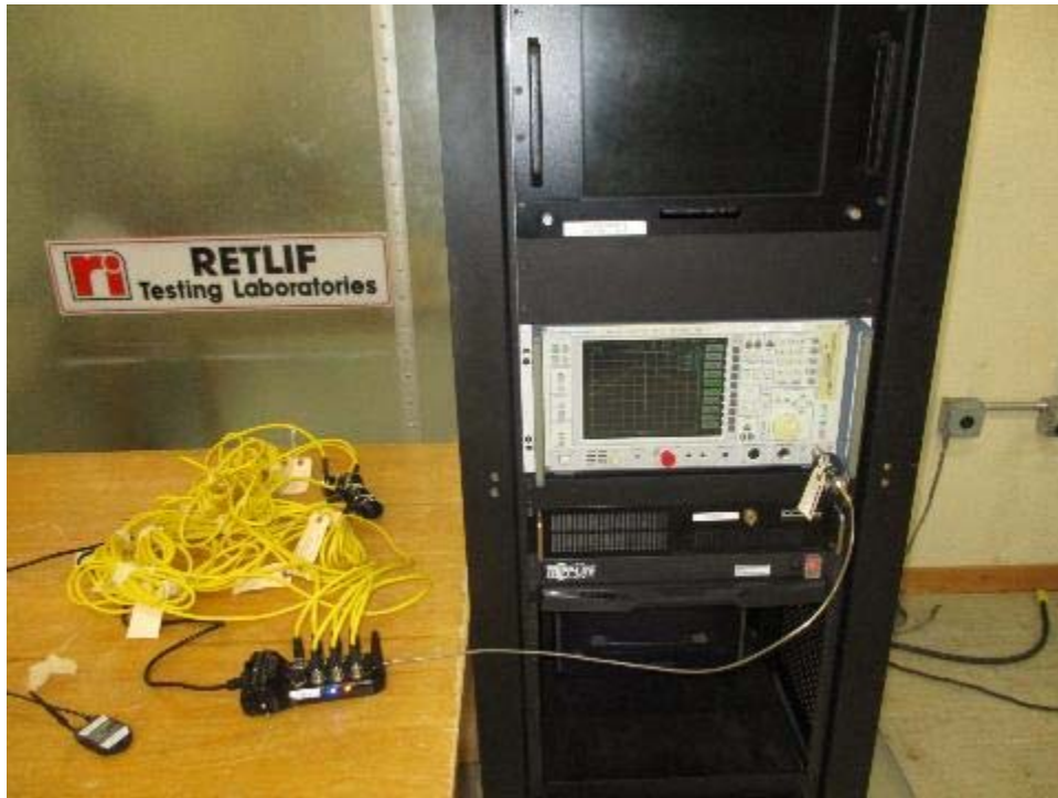
Test Setup, MA