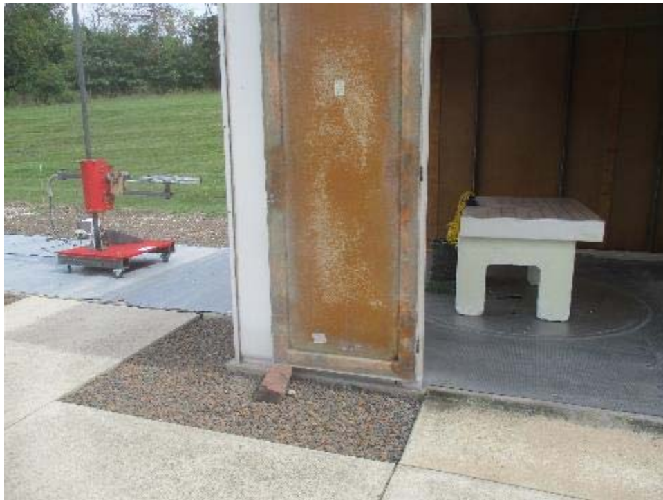
Horizontal Antenna Polarization, 200 to 1000 MHz