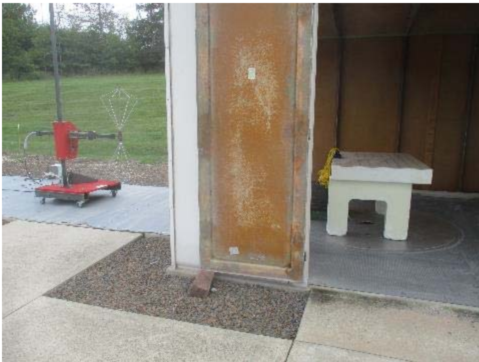
Vertical Antenna Polarization, 30 to 200 MHz