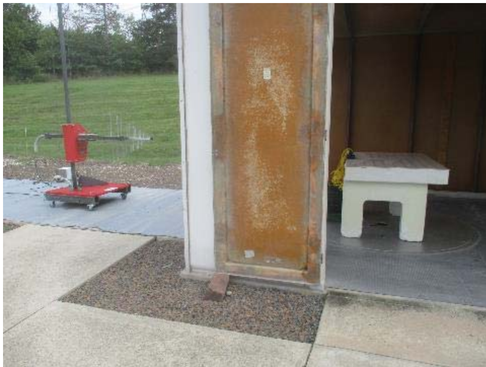
Vertical Antenna Polarization, 200 to 1000 MHz