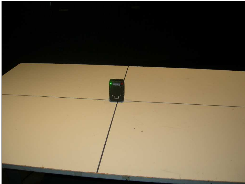
Figure 1: Radiated Emissions – XPOS