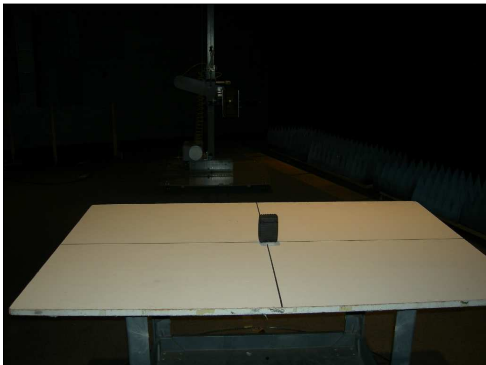
Figure 2: Radiated Emissions – XPOS