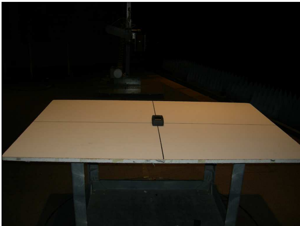
Figure 6: Radiated Emissions – ZPOS