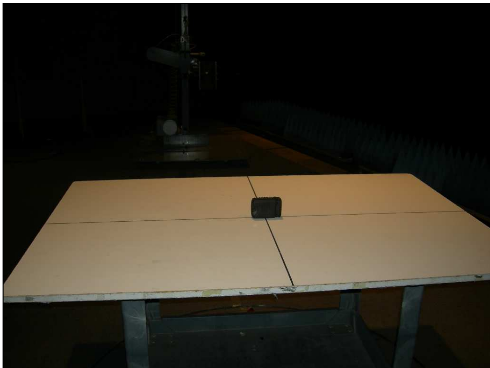
Figure 4: Radiated Emissions – YPOS