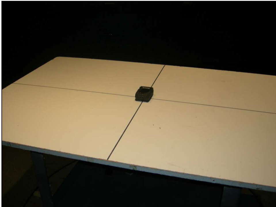
Figure 5: Radiated Emissions – ZPOS