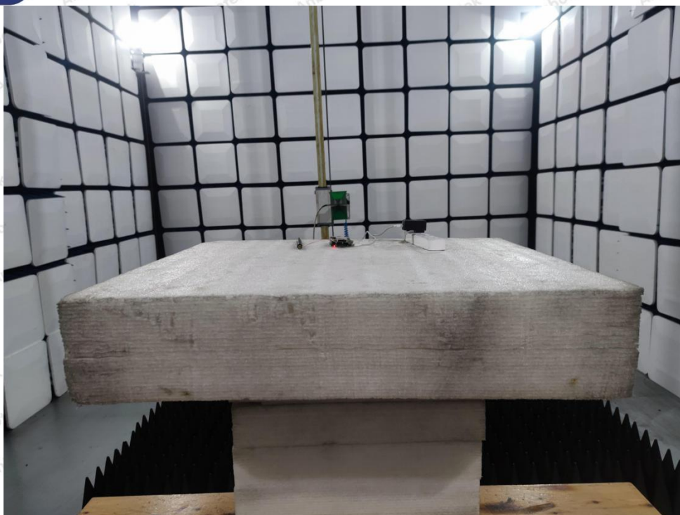
ANT 2: Photo of Conducted Emission Measurement