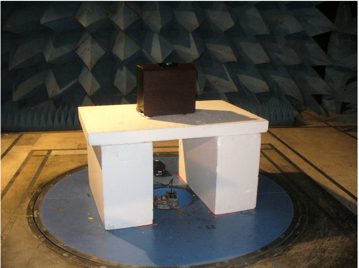
Figure 1: Radiated Emissions – Front View below 1 GHz