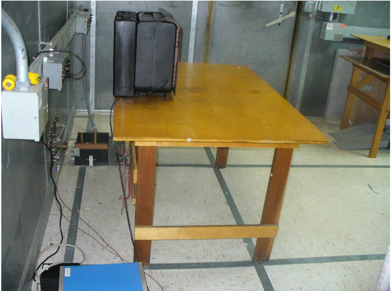
Figure 7: Power Line Conducted Emissions – Side View