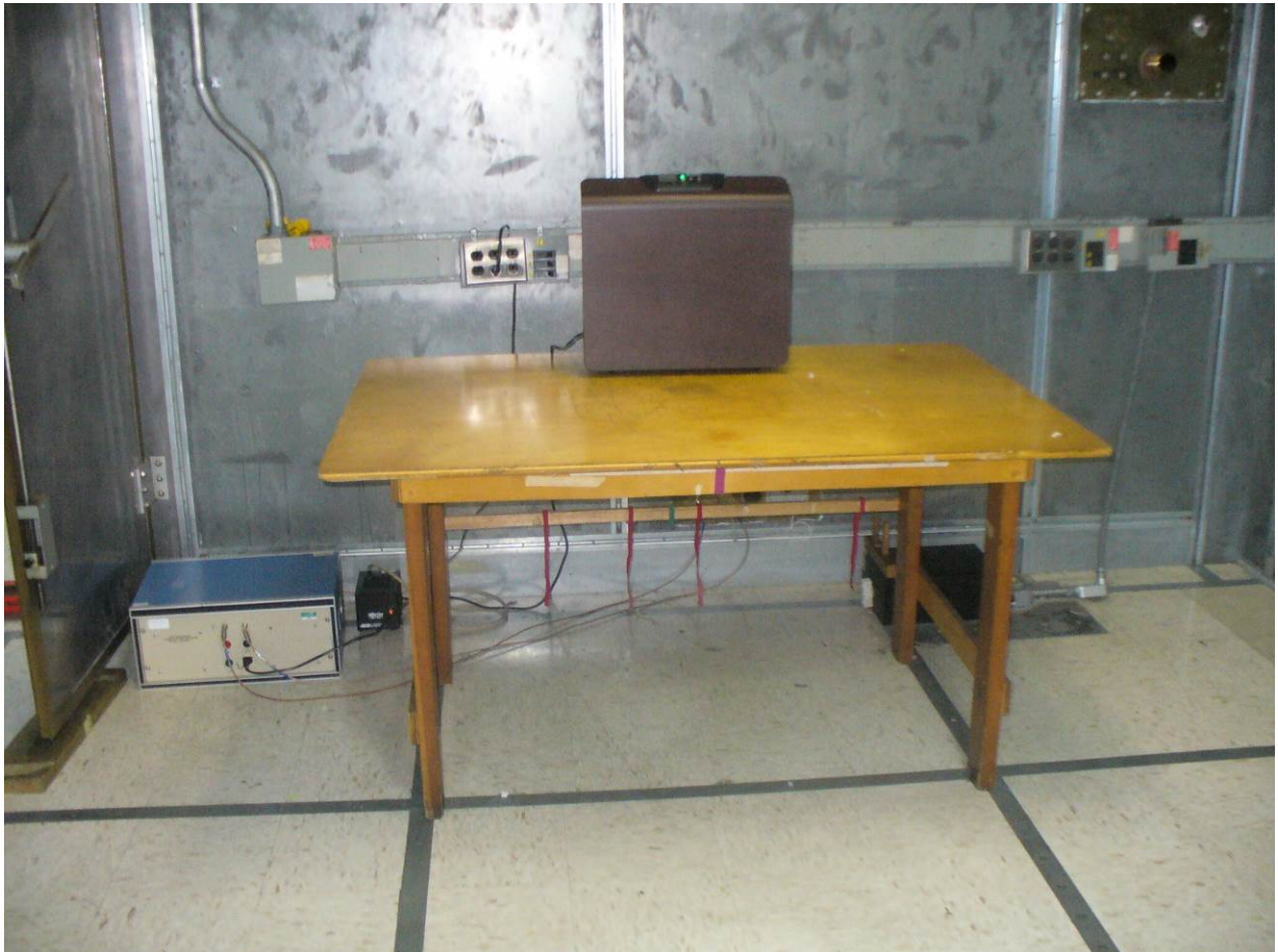
Figure 6: Power Line Conducted Emissions – Front View