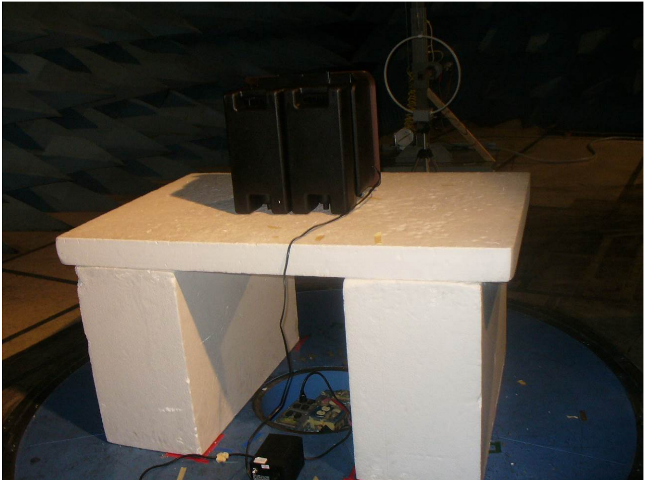
Figure 2: Radiated Emissions – Back View – 9 kHz – 30 MHz