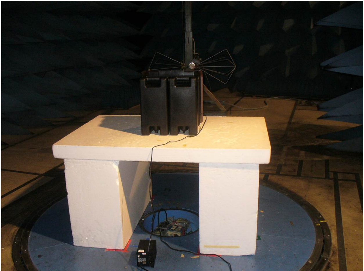
Figure 3: Radiated Emissions – Back View – 30 MHz – 200 MHz