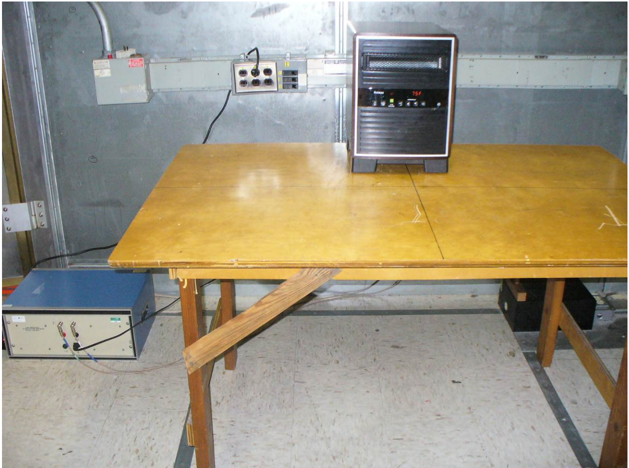
Figure 3: Power Line Conducted Emissions – Front View