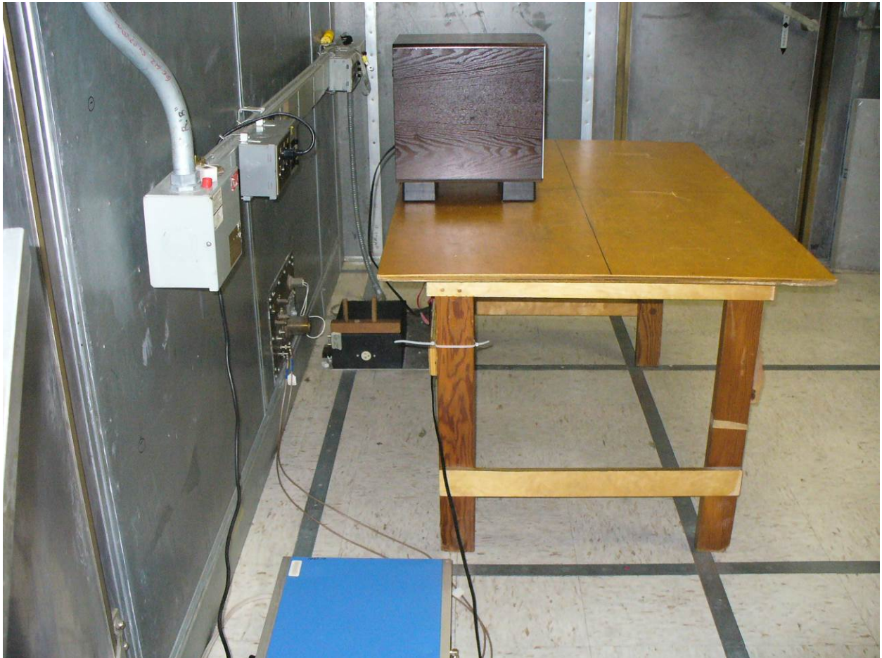
Figure 4: Power Line Conducted Emissions – Side View