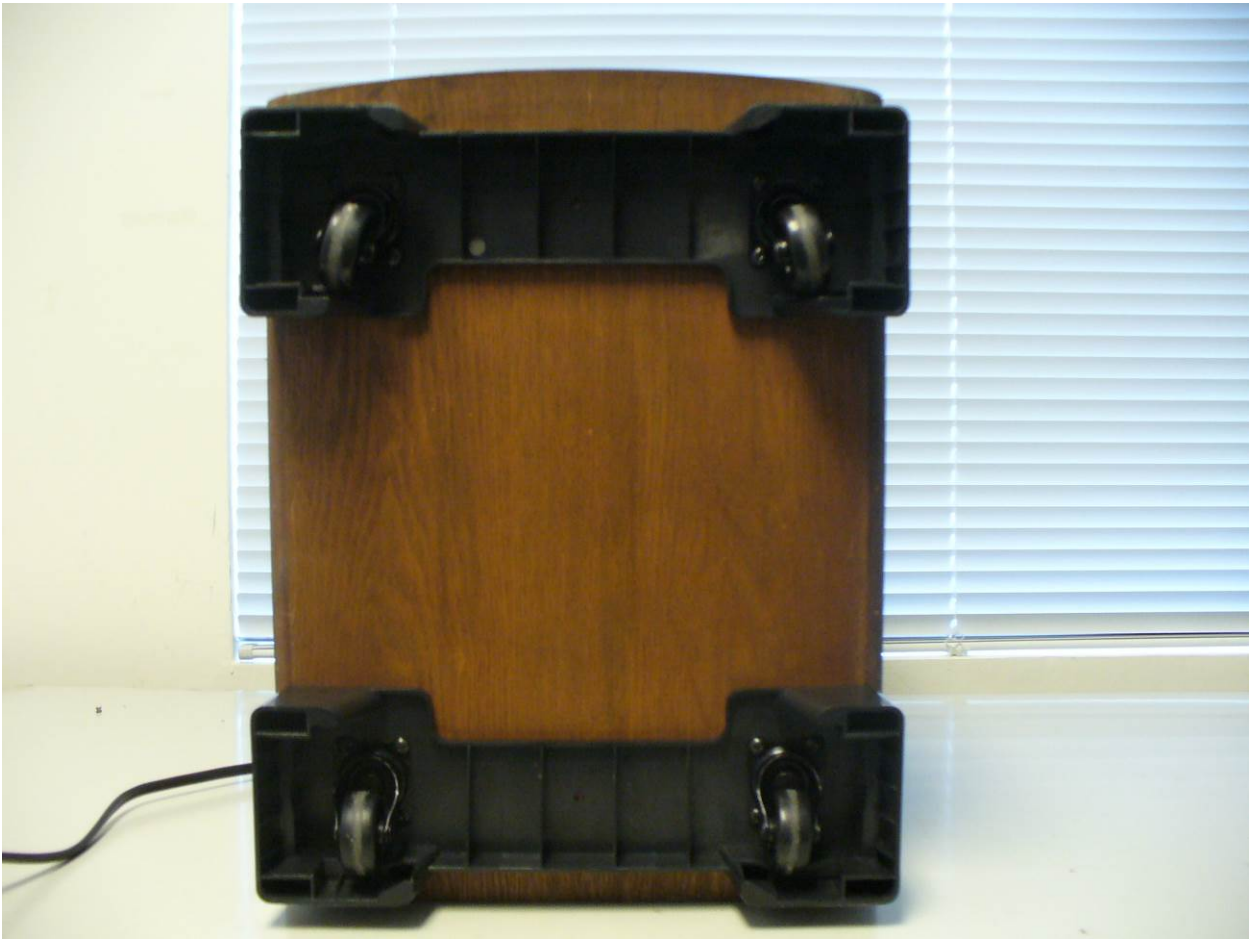
Figure 11: Host – Bottom View