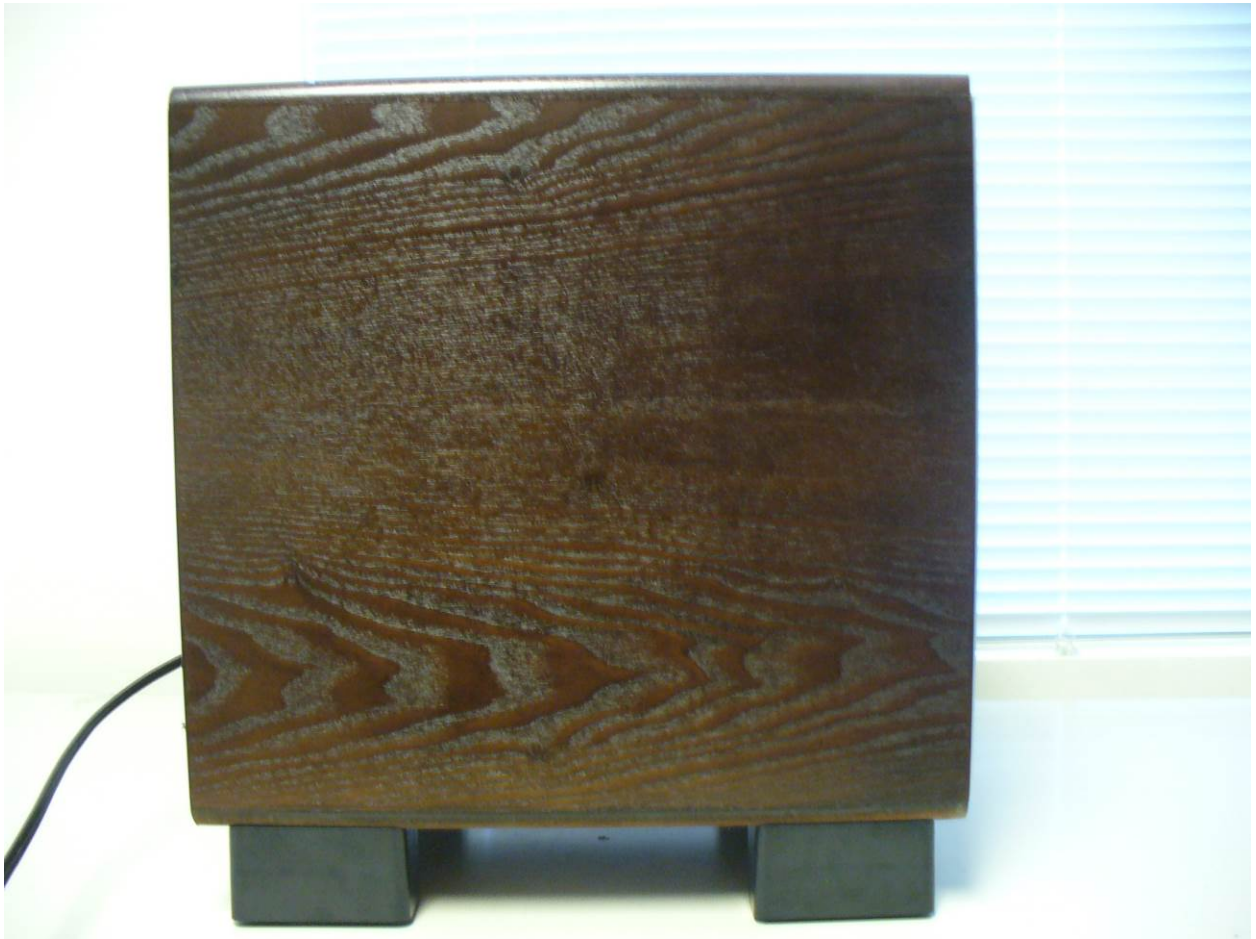
Figure 8: Host – Side View