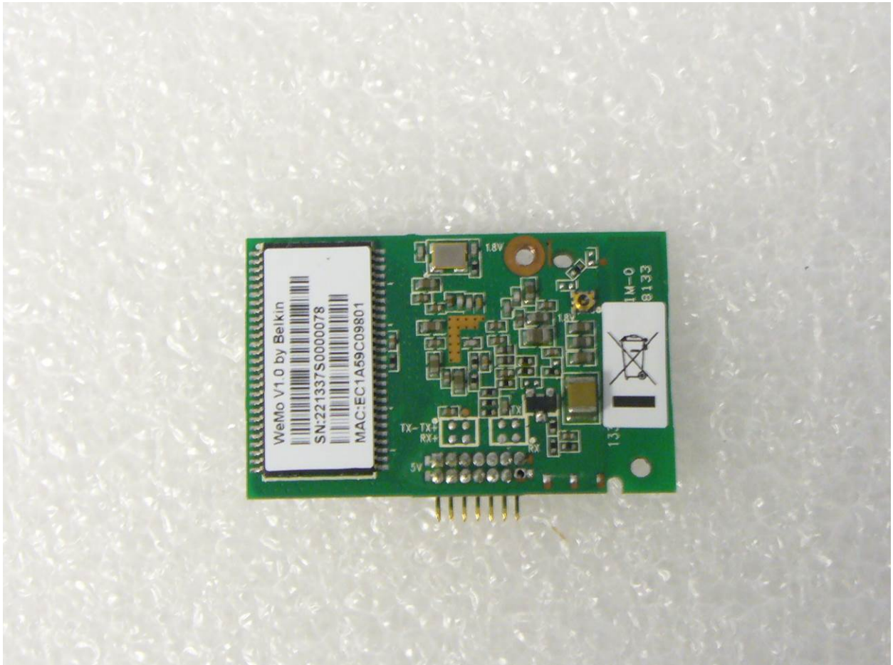
Figure 2: Bottom View