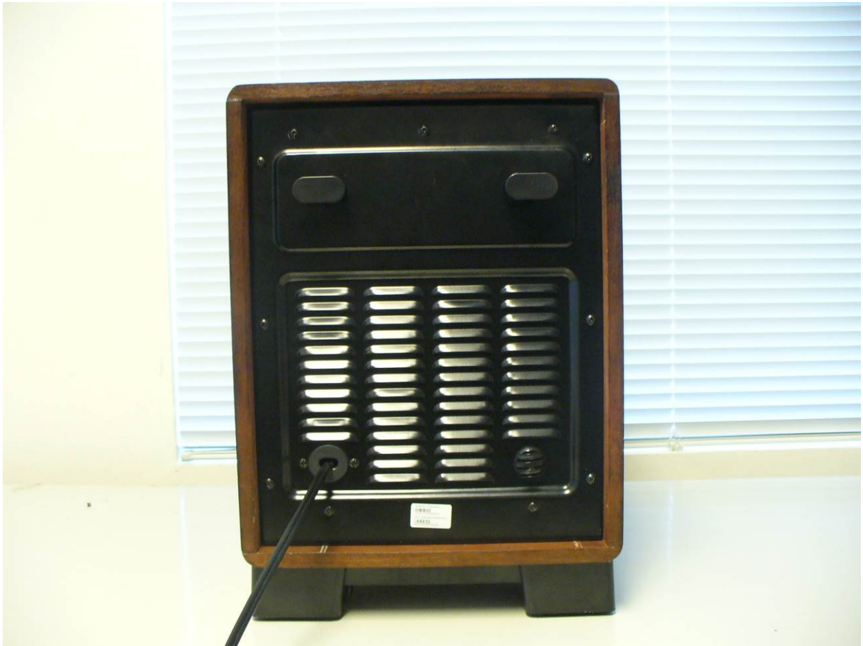
Figure 7: Host – Rear View