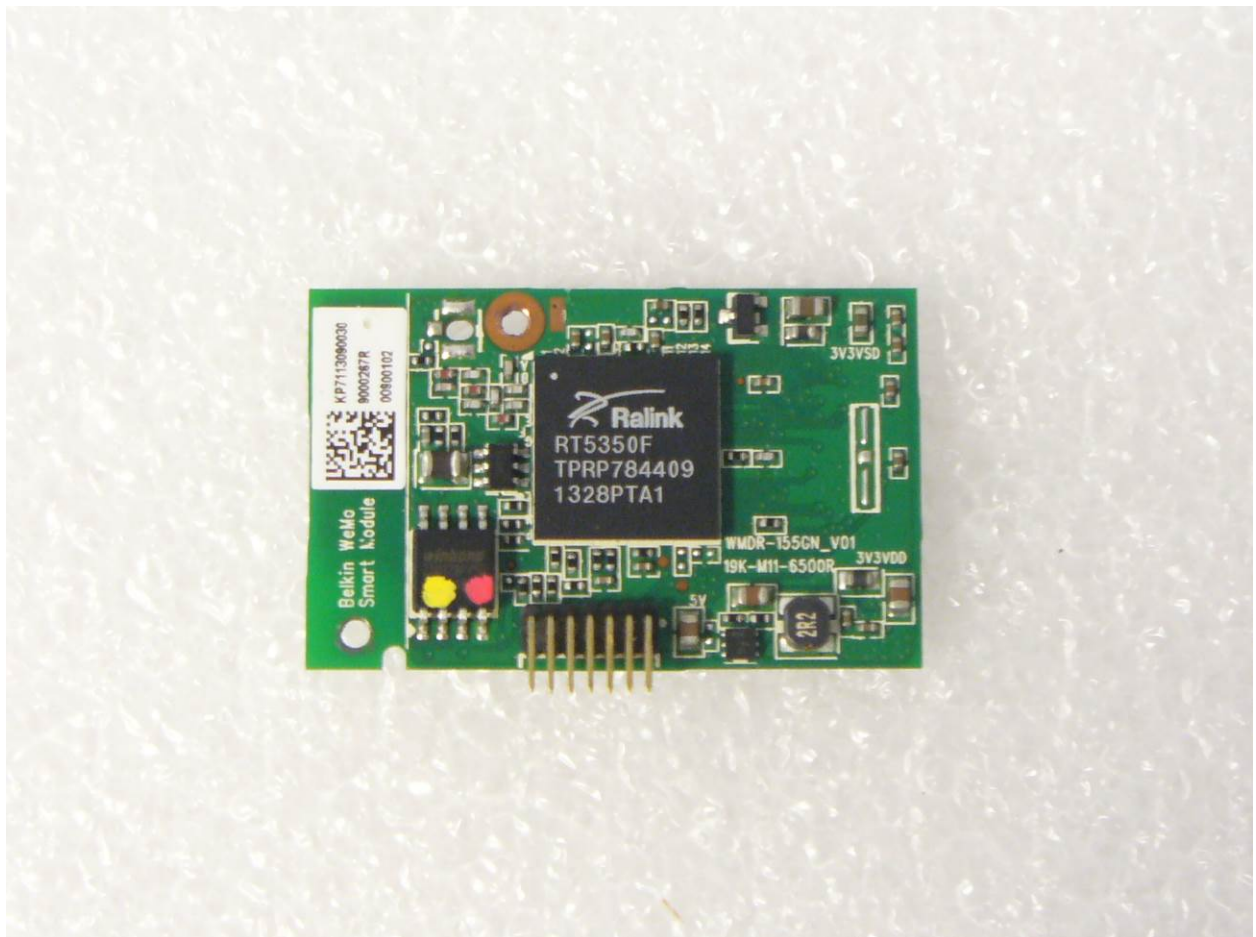
Figure 1: Top View