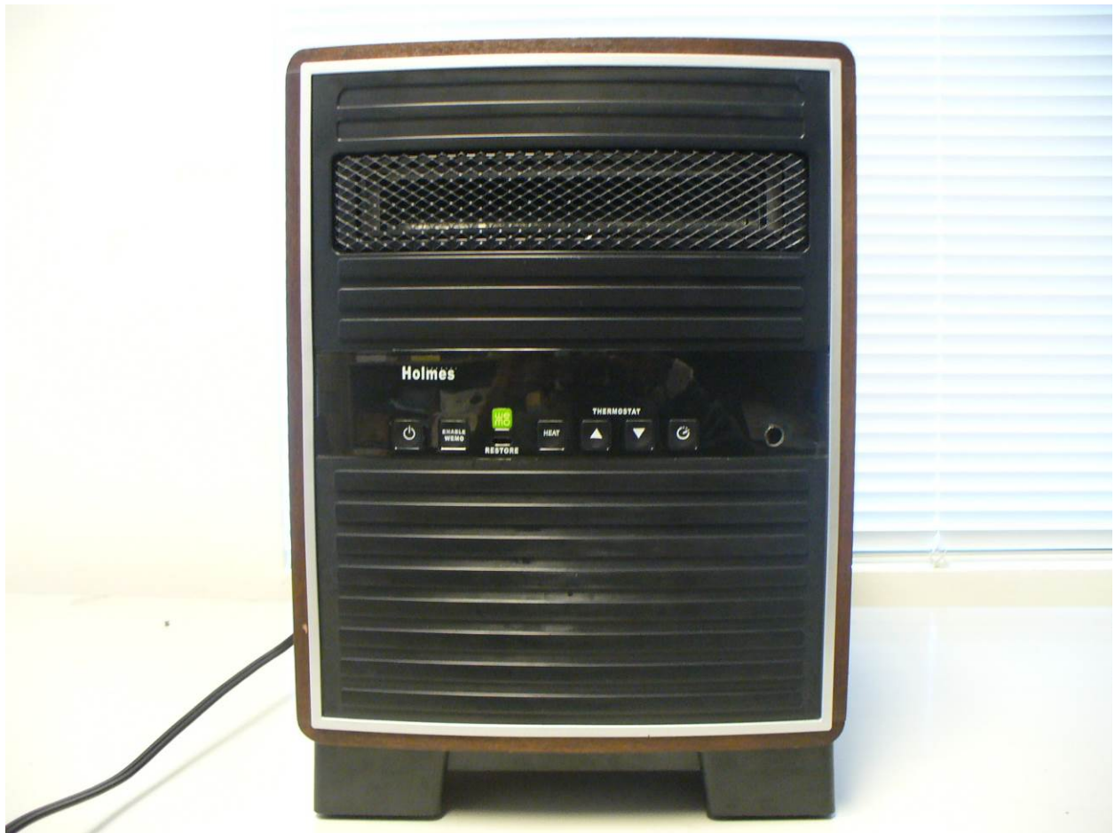
Figure 6: Host – Front View