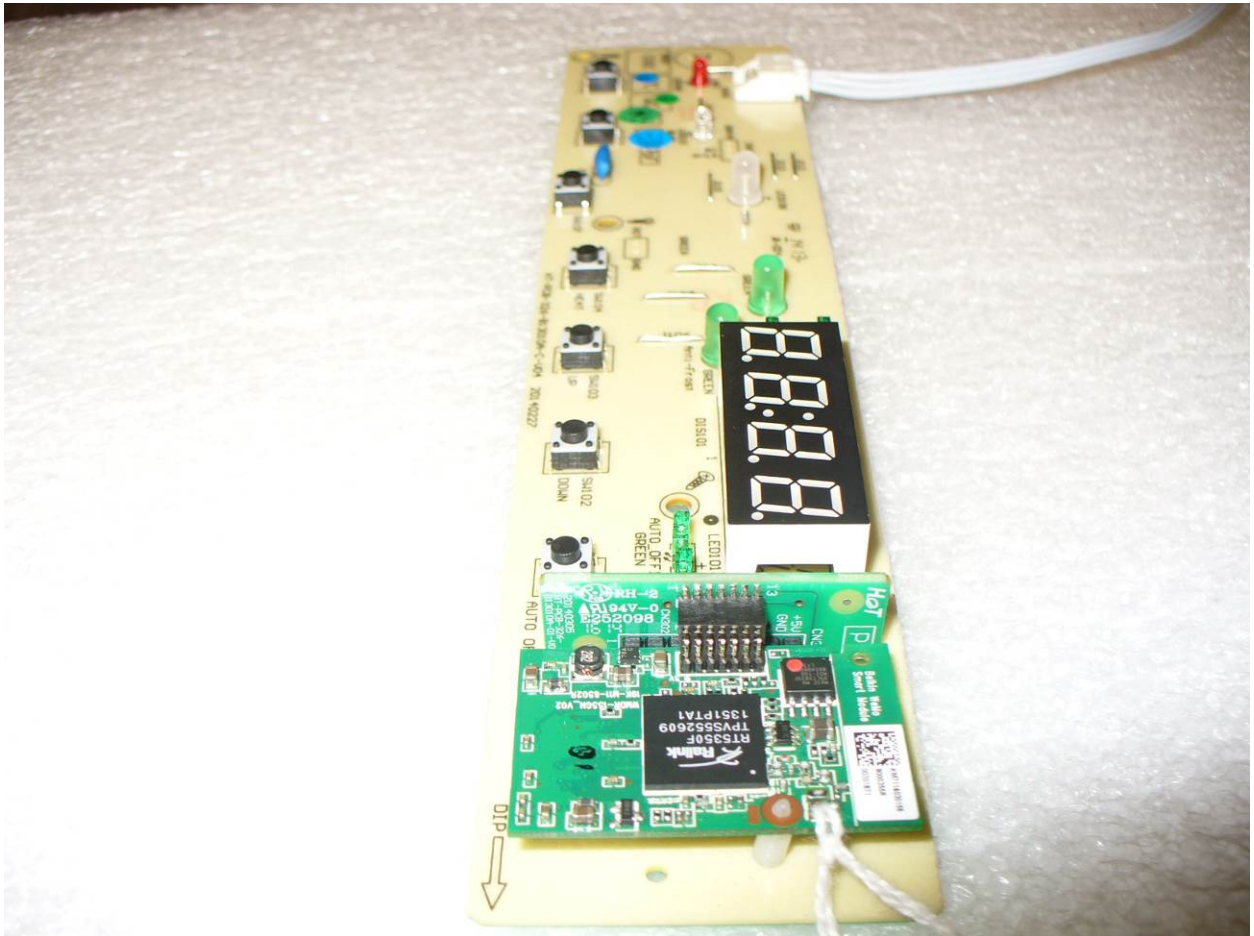
Figure 4: Installed in Host – View 2