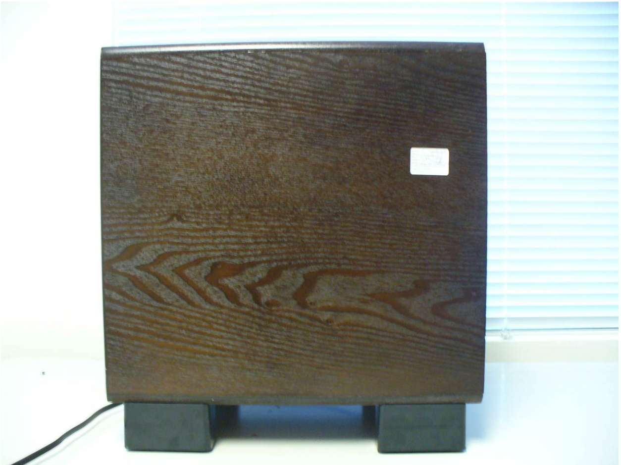
Figure 9: Host – Side View