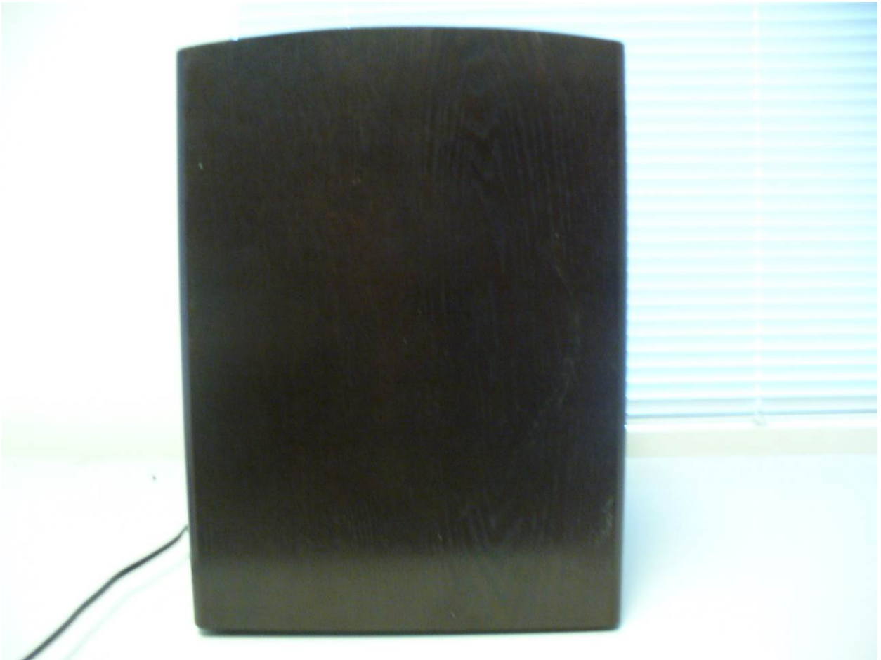
Figure 10: Host – Top View